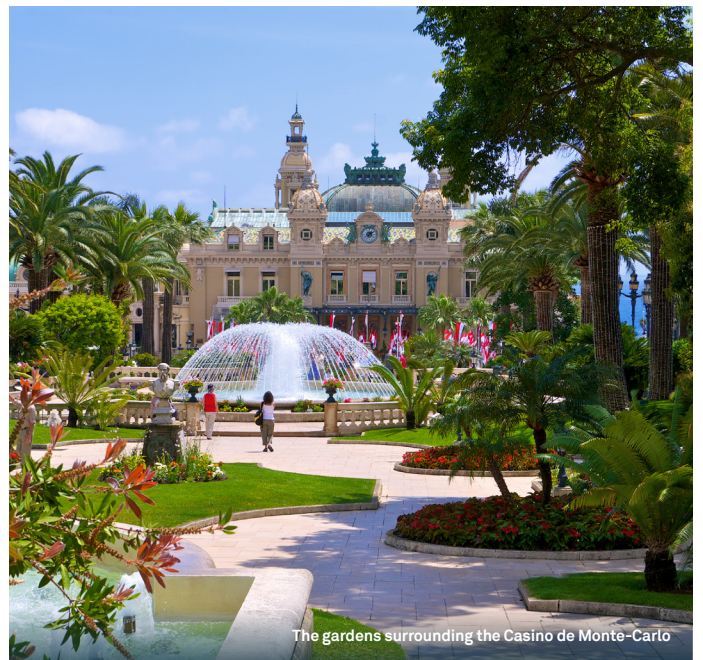
The gardens surrounding the Casino de Monte-Carlo

The itinerary is a guide only and may be amended for operational reasons. As such Mayflower & Scenic cannot guarantee the tour will operate unaltered from the itinerary stated above. Please refer to our terms and conditions for further information.