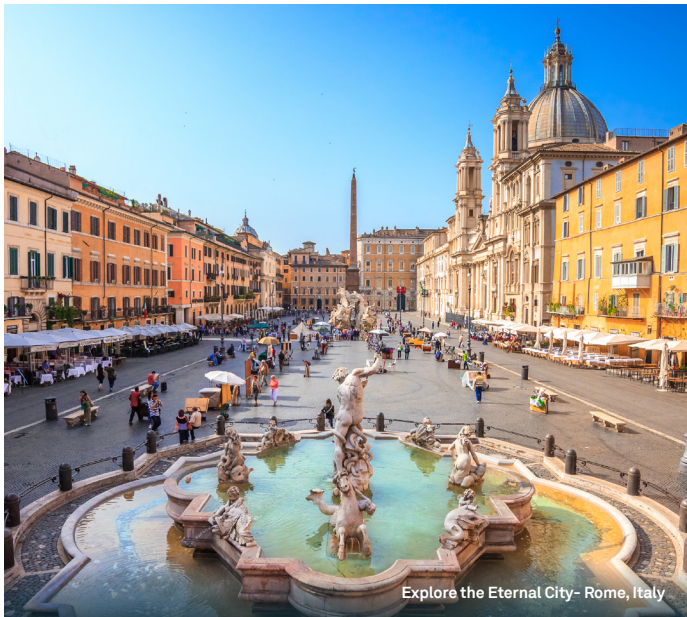
Explore the Eternal City- Rome, Italy