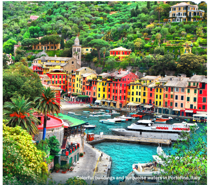
Colorful buildings and turquoise waters in Portofino, Italy

covered hills. Thanks to another late departure, you'll have ample time to explore luxury boutiques, take a dip in the turquoise bay, savor impeccably fresh seafood, and spot celebrities at the exclusive bars scattered around the iconic Piazzetta. Meals: B. L. D.