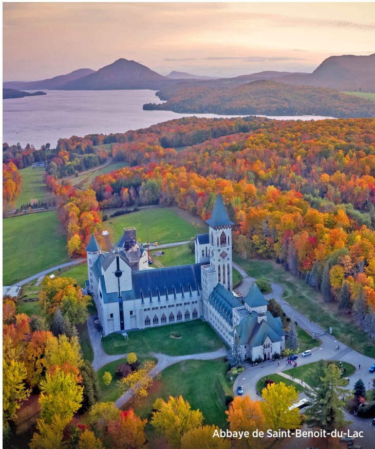
Abbaye de Saint-Benoit-du-Lac