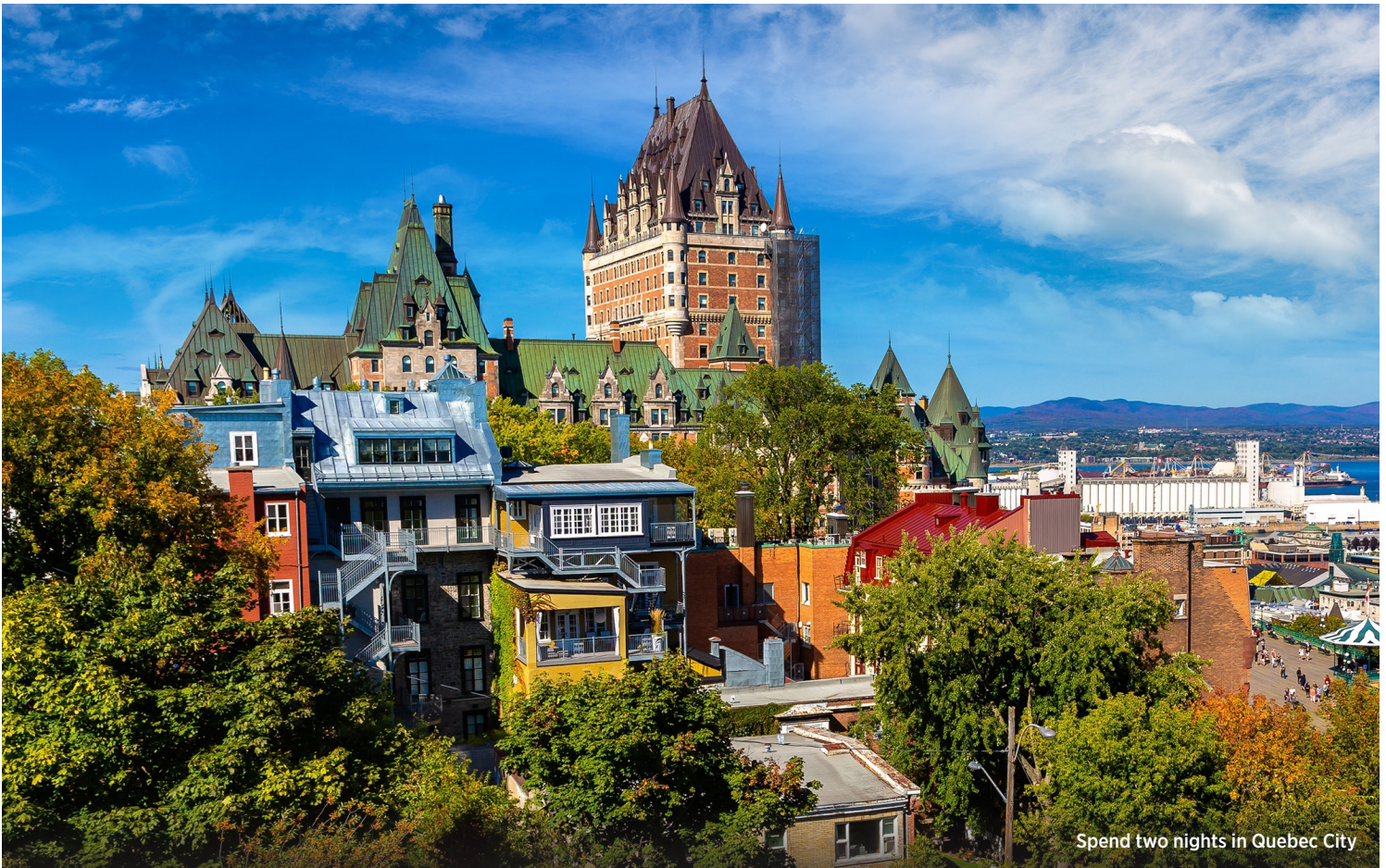
Spend two nights in Quebec City