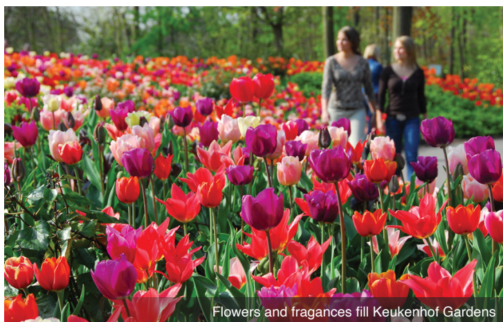
Flowers and fragrances fill Keukenhof Gardens