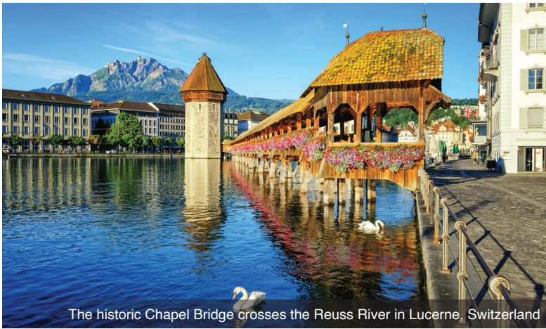
The historic Chapel Bridge crosses the Reuss River in Lucerne, Switzerland

DAY 8 Breisach, Germany: Experience the ‘tale of two cities’: Breisach, Germany and Neuf-Breisach, France, divided by the Rhine. During the guided visit to these two wonderful gems on the Rhine River, you’ll pass the main sights and attractions, including the UNESCO World Heritage fortress overlooking Neuf-Breisach. Meals: B, L, D