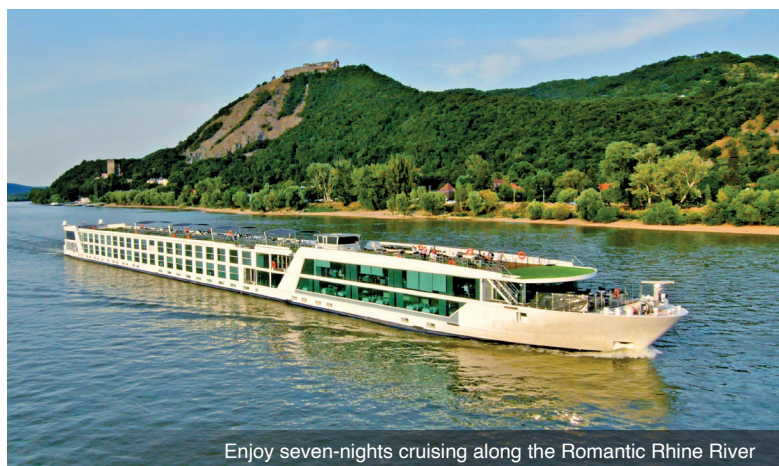
Enjoy seven-nights cruising along the Romantic Rhine River

DAY 1 Depart the USA: Depart the USA on your overnight flight to Amsterdam, the Netherlands.