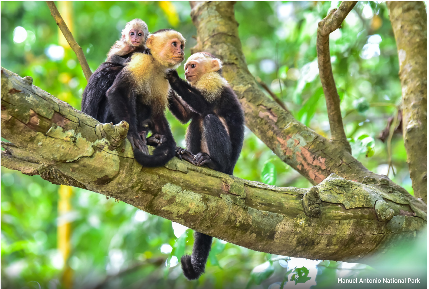
Manuel Antonio National Park