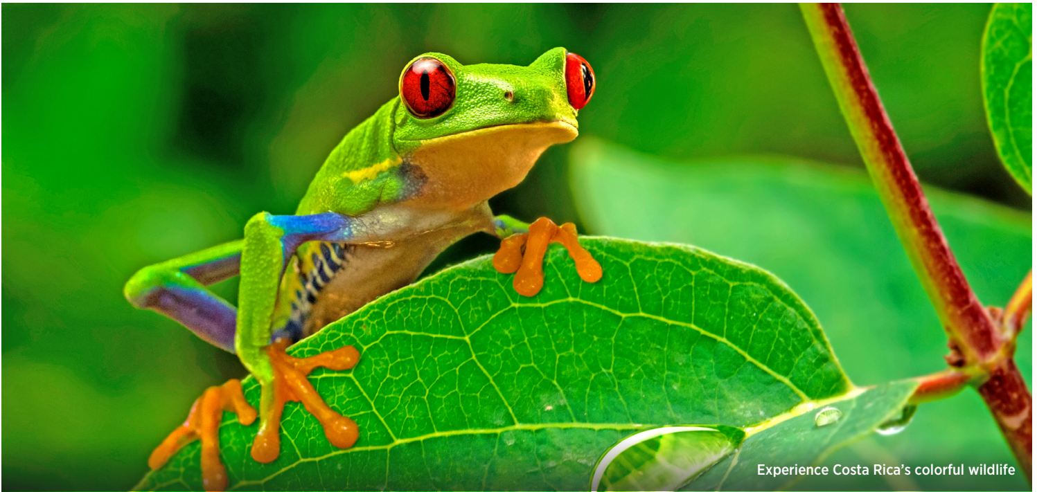
Experience Costa Rica's colorful wildlife