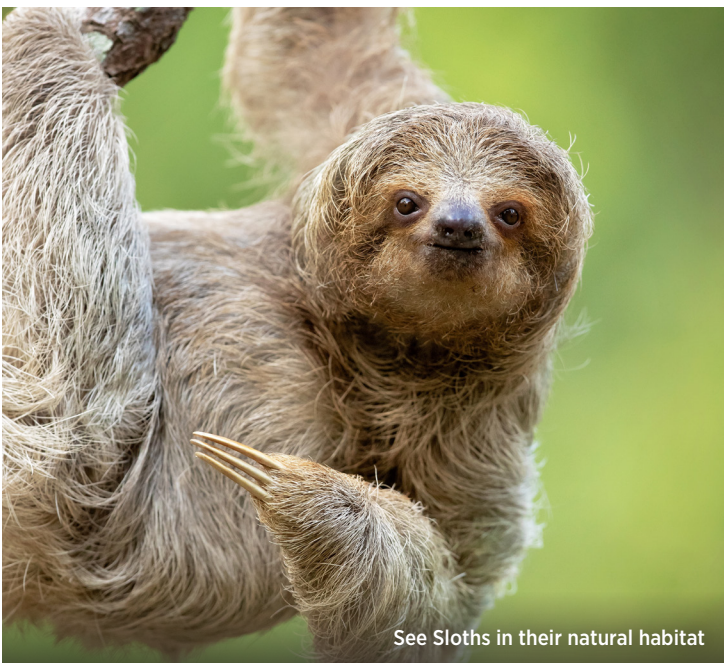
See Sloths in their natural habitat

While in the Arenal area, enjoy a full day excursion to Caño Negro National Wildlife Refuge, a remote "everglades" type wetlands, teeming with different species of flora, fauna and birdlife. Enjoy a boat ride on the Rio Frio, where you'll have an opportunity to see a plethora of wildlife: snake-birds, heron, comorants, howler, spider and white-faced monkeys, three-toed sloth, basilik lizards (also known as Jesus Christ lizards), turtles and much more. This unique experience showcases the natural beauty of Costa Rica. A typical lunch is provided during the excursion. This evening, dinner is included at the hotel. Meals: B, L, D