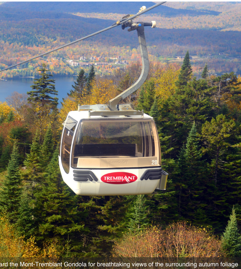
Board the Mont-Tremblant Gondola for breathtaking views of the surrounding autumn foliage

DAY 6 Mont-Tremblant Gondola and Ottawa: Depart Montreal this morning and travel to Mont-Tremblant. Here, climb aboard the gondola and be whisked away to the top of the mountain for breathtaking views of the surrounding autumn foliage. After your included lunch, continue to the Canadian capital city of Ottawa.