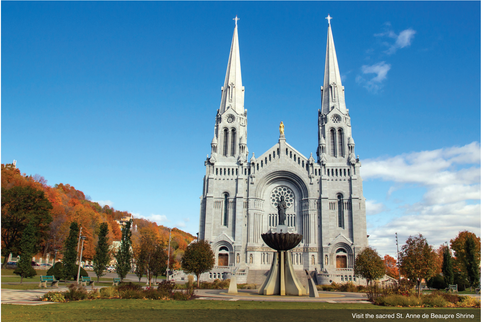
Visit the sacred St. Anne de Beupre Shrine