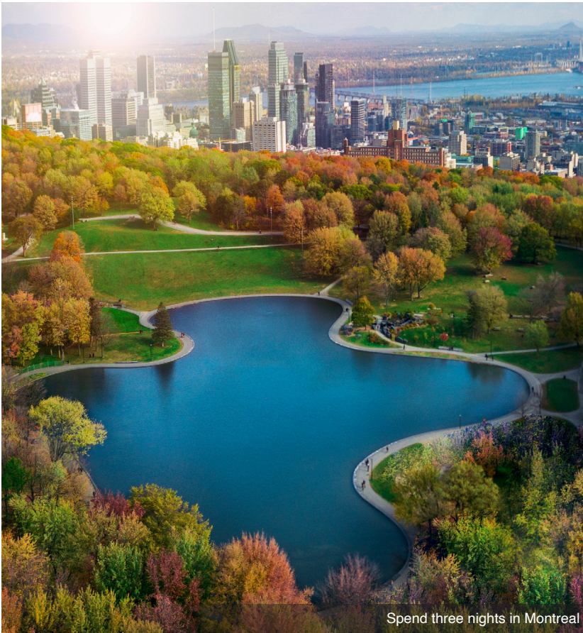
Spend three nights in Montreal