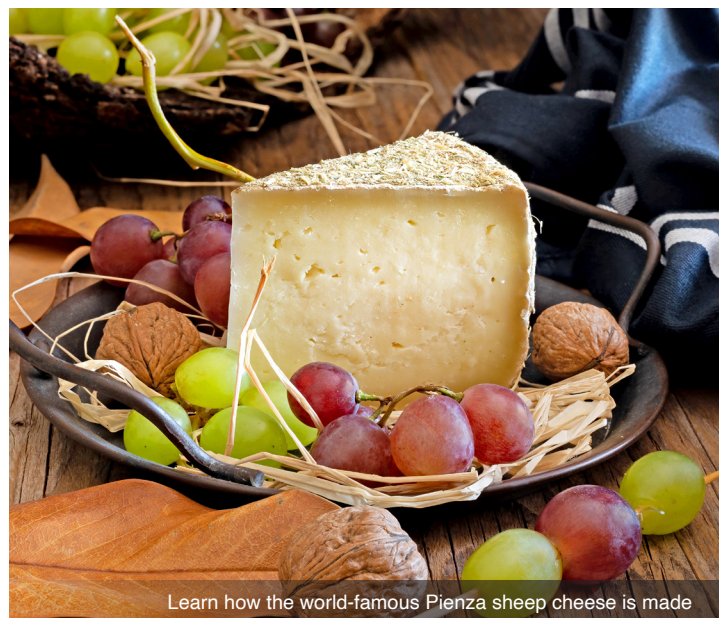
Learn how the world-famous Pienza sheep cheese is made