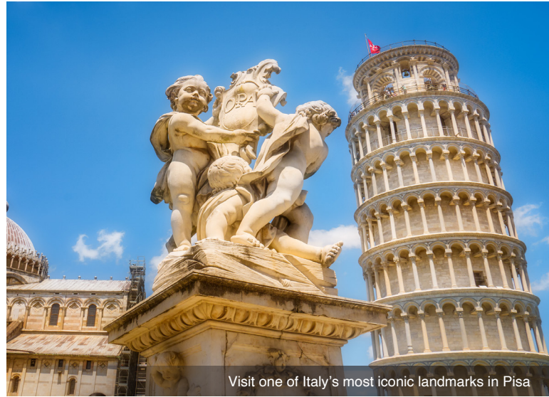
Visit one of Italy's most iconic landmarks in Pisa

DAY 1 Depart the USA: Depart the USA on your overnight flight to Florence, Italy.