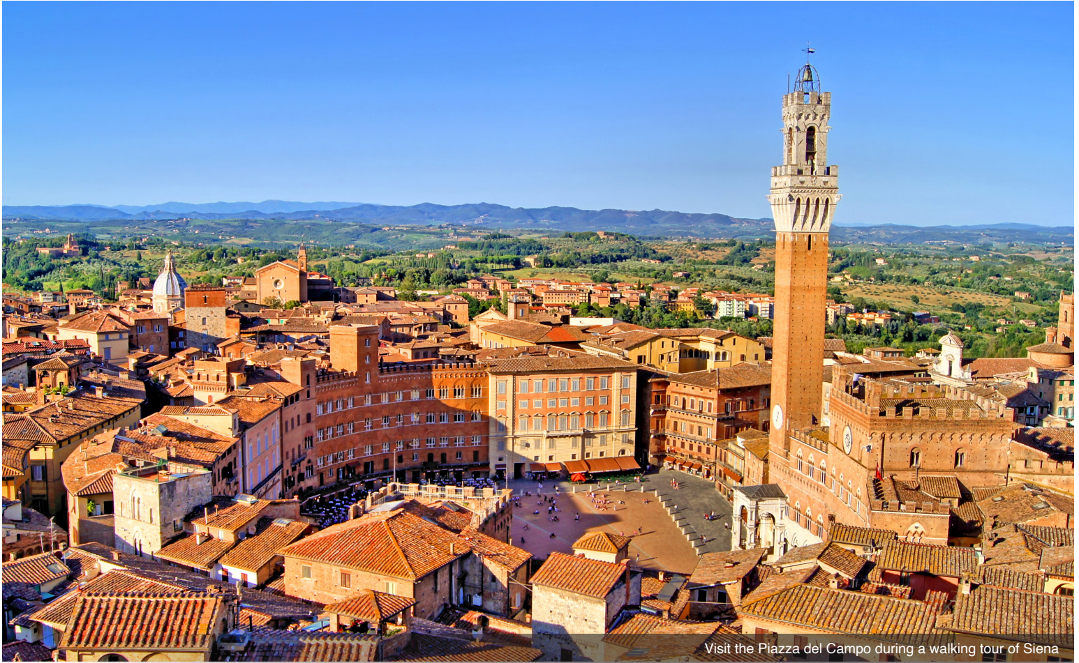
Visit the Piazza del Campo during a walking tour of Siena