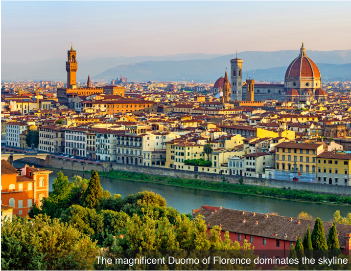
The magnificent Duomo of Florence dominates the skyline