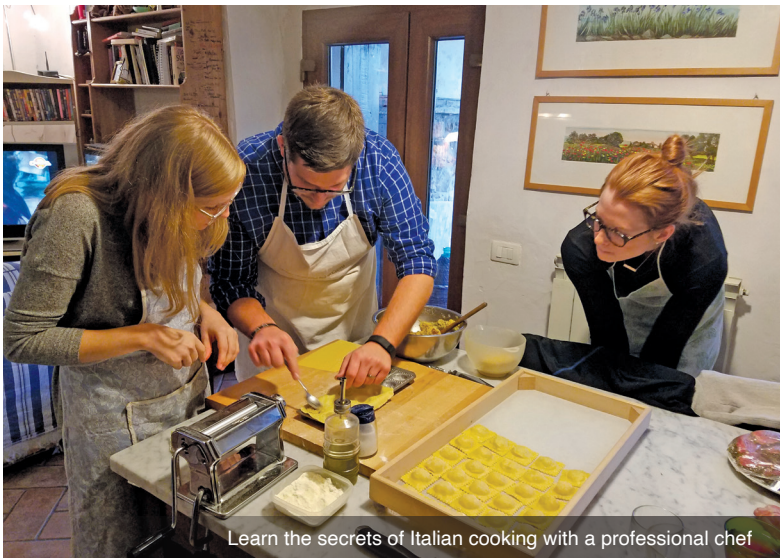
Learn the secrets of Italian cooking with a professional chef

the magnificent scenery and landscapes of the Crete Senesi. Upon arrival in Pienza, visit a local organic farm, meet the owner and learn how the world-famous Pienza sheep cheese is made. Explore the farm with the owner, see the stables and aging rooms of the cheese, along with a demonstration of the process of this ancient art. A highlight of the visit may be the tasting of the product during the light lunch at the farm. The guided walking tour of Pienza will have you admiring the architectural jewels of the main square, Piazza Pio II, a UNESCO World Heritage Site, and home of the town's main monuments and cathedral. Return to Siena for the evening at leisure. Meals: B, L