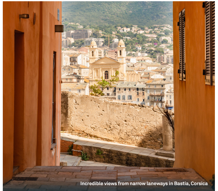
Incredible views from narrow laneways in Bastia, Corsica