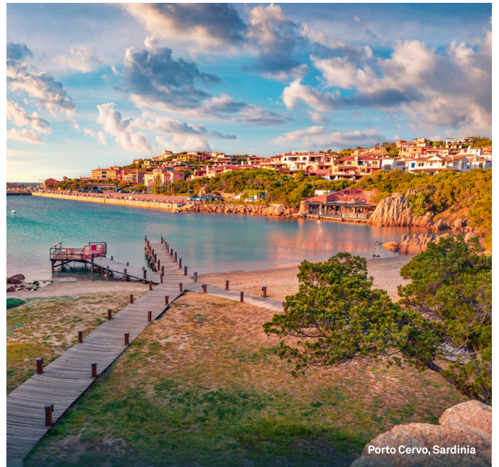
Porto Cervo, Sardinia

Nestled in the heart of Sardinia's Costa Smeralda, this paradisiacal town blends romantic, traditional architecture with vibrant Mediterranean beauty. Built as a millionaire's playground by Prince Aga Khan in the 1960s, Porto Cervo oozes luxury with high-end boutiques, stylish restaurants, glamorous nightclubs, world-class golf courses, sumptuous hotels and golden beaches. Very few passenger ships visit Porto Cervo, so you could have this chic town all to yourself, but look out for celebrities on the waiting superyachts or strolling the streets. Meals: B. L. D.