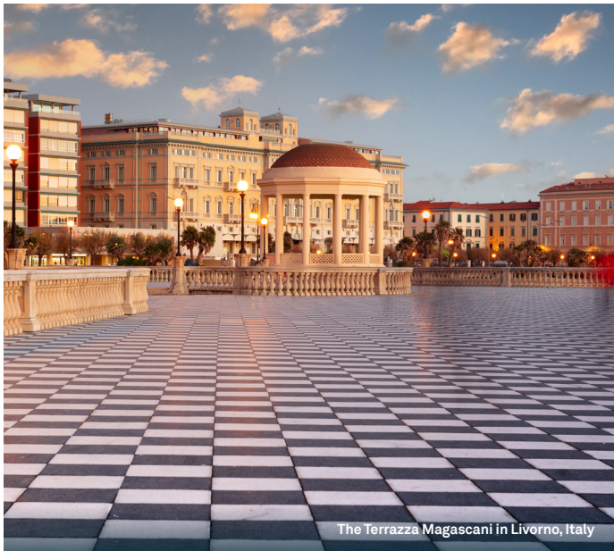
The Terrazza Magascani in Livorno, Italy