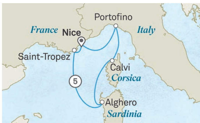
— Cruise | 📍 Cruise start/finish | ⑤ Overnight stay

OR, Old Villages of Corsica: Visit the ancient circular village of Sant'Antonio, the hilltop village of Pigna and the timeless beauty of Corbara and Aregno on this coastal tour.