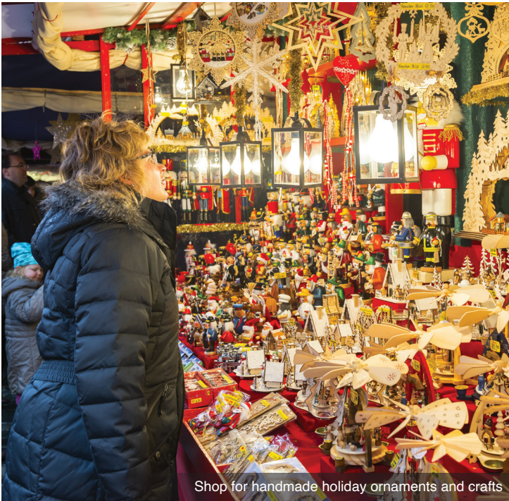
Shop for handmade holiday ornaments and crafts