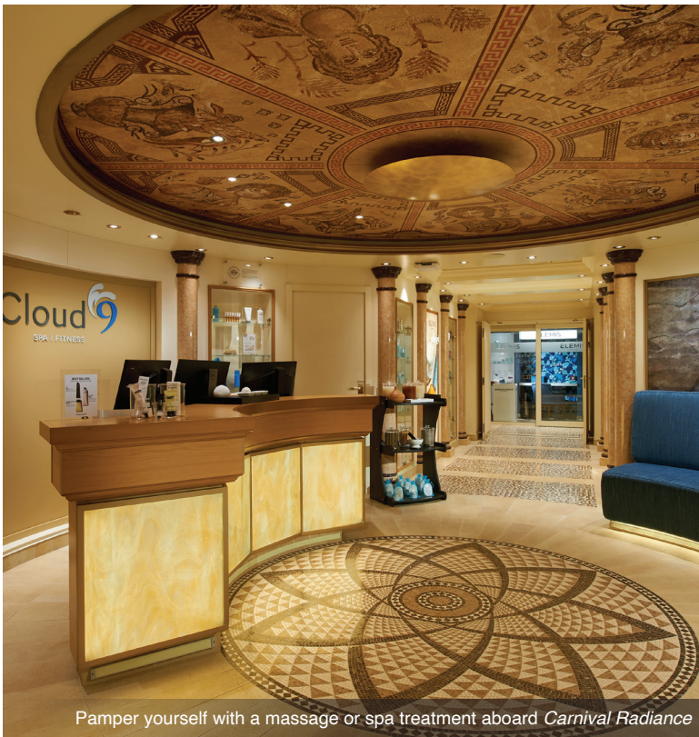
Pamper yourself with a massage or spa treatment aboard Carnival Radiance

boutiques and shops selling all sorts of artifacts and artwork. The elegant Avenida Lopez Mateos offers excellent buys on silver jewelry, pottery, decorative masks and leather clothing. You may choose to pass the day in a cozy cantina where mariachi bands stroll by to serenade you or maybe stroll the silvery sand and sun-drenched beaches and explore wonders like La Bufadora, a natural geyser that sprays water up to 50 feet high. Meals: B, L, D