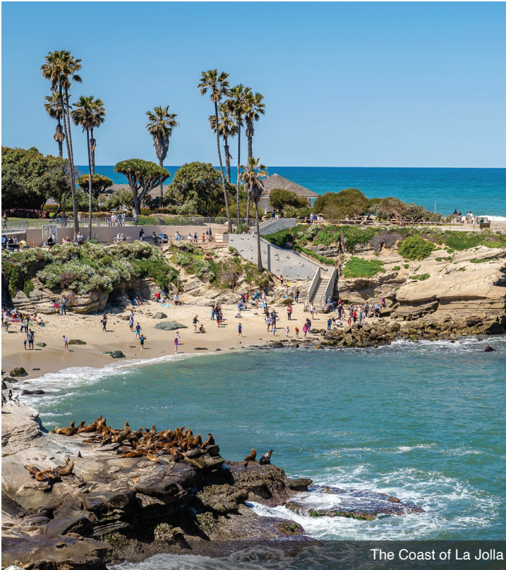
The Coast of La Jolla