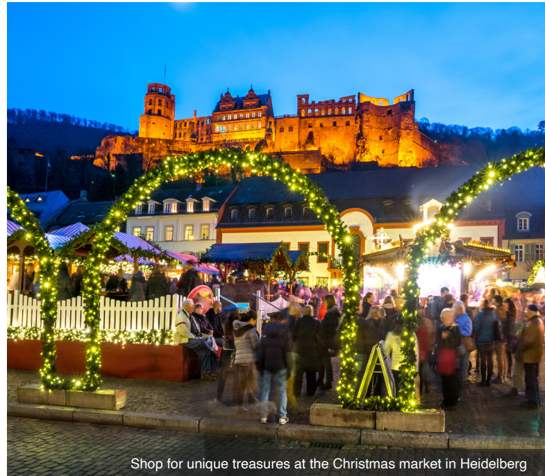
Shop for unique treasures at the Christmas market in Heidelberg

DAY 1 Depart the USA: Depart the USA on your overnight flight to Zurich, Switzerland.