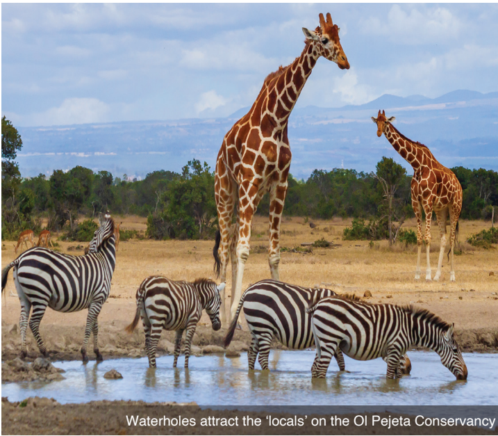
Waterholes attract the 'locals' on the OI Pejeta Conservancy