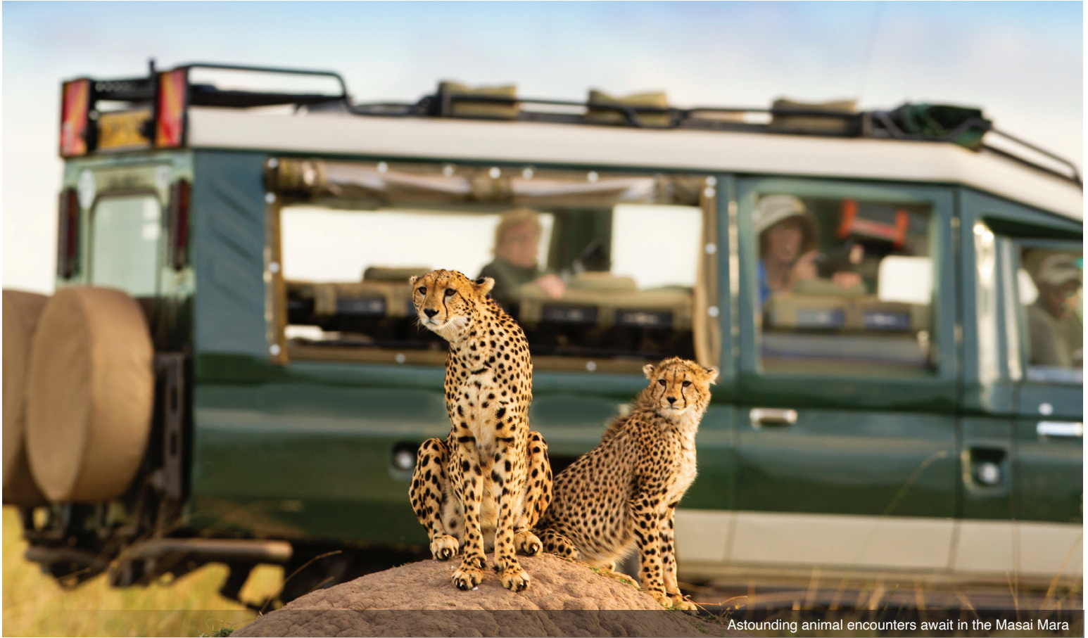
Astounding animal encounters await in the Masai Mara