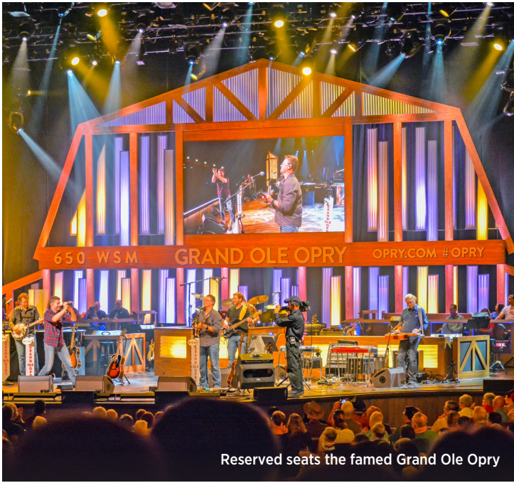
Reserved seats the famed Grand Ole Opry