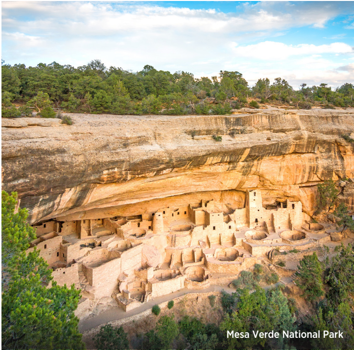
Mesa Verde National Park

America's most spectacular narrow gauge steam railroad. Explore 50 miles of wild and rugged territory between Chama, New Mexico and Antonito, Colorado, the highest point on the railroad. Meals: B, L