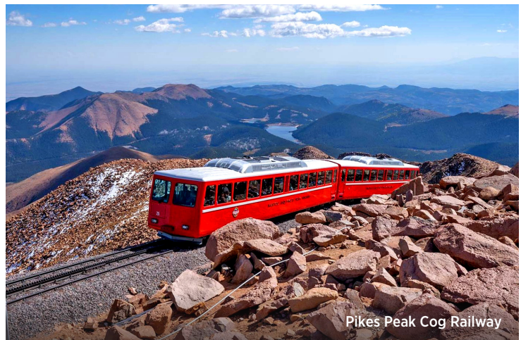
Pikes Peak Cog Railway