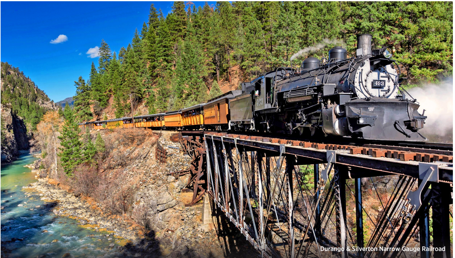
Durango & Silverton Narrow Gauge Railroad