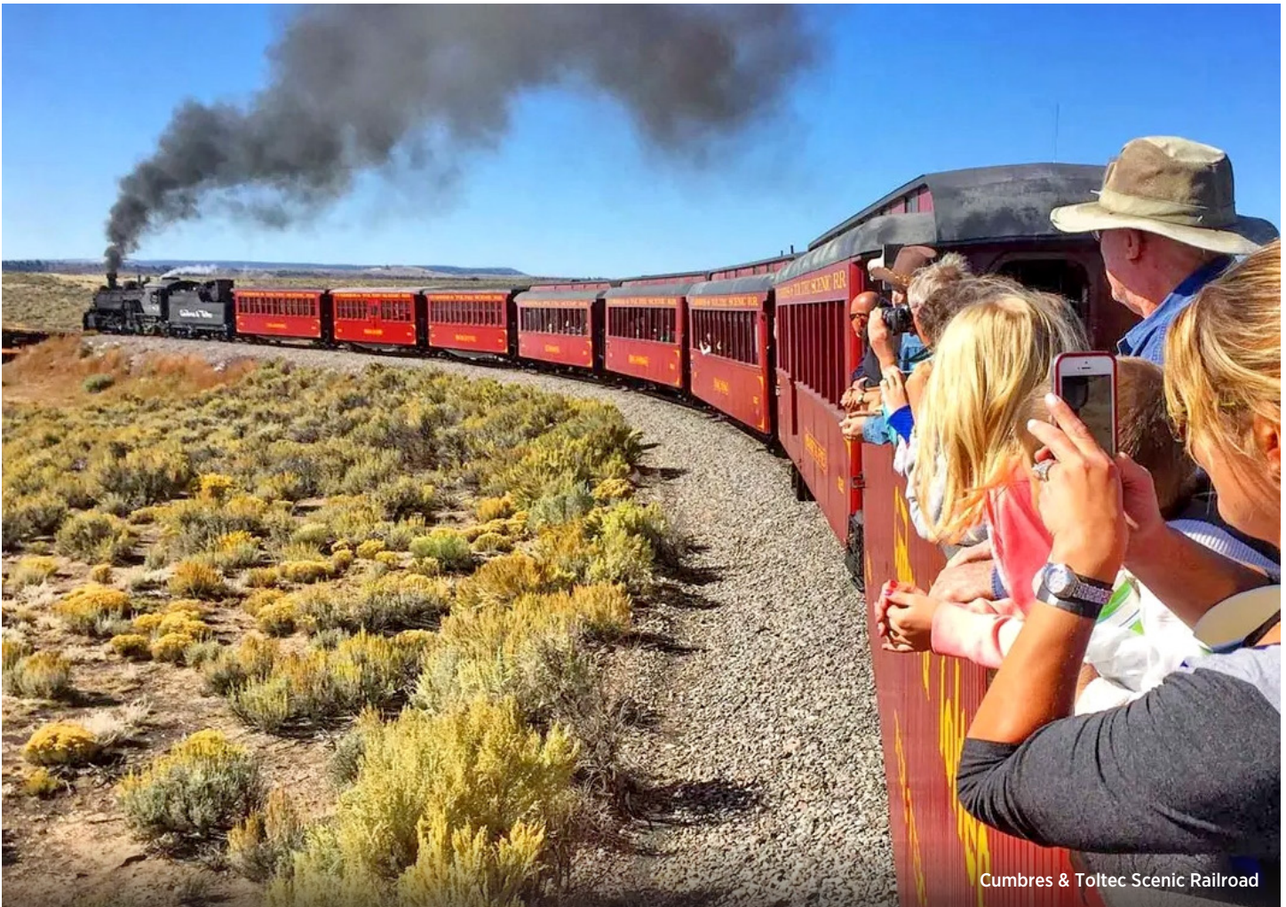
Cumbres & Toltec Scenic Railroad