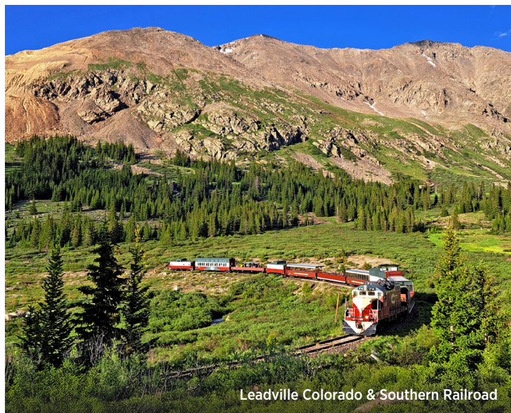
Leadville Colorado & Southern Railroad

Departing Denver, venture into Rocky Mountain National Park, a living showcase of the grandeur of the Rocky Mountains. With elevations ranging from 8,000 feet on the wet, grassy valleys to 14,259 feet at the weather-ravaged top of Longs Peak, the park is filled with breathtaking scenery and experiences. Following the Trail Ridge Road a stop at the Alpine Visitor Center offers an opportunity to learn more about this fascinating place. Meal: B