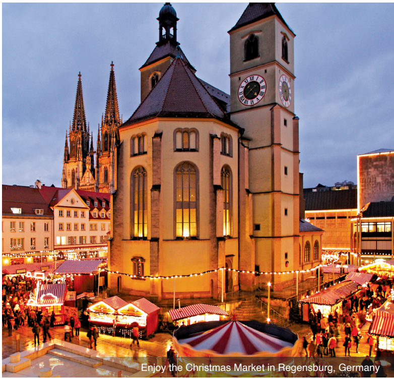
Enjoy the Christmas Market in Regensburg, Germany

homemade gingerbread! Enjoy the last day of your cruise in this historic city, decked out for the holidays. Meals: B, L, D