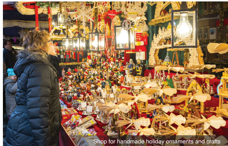
Shop for handmade holiday ornaments and crafts

Days 2 through 8 – Aboard an Emerald Cruises Star-Ship