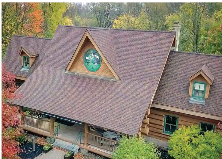
Stop at the Shako:wi Cultural Center and learn the history of the Oneida nation

DAY 8 Return Home: This morning a group transfer to the Syracuse Hancock International Airport for flights out after 12:00 p.m. Meal: B