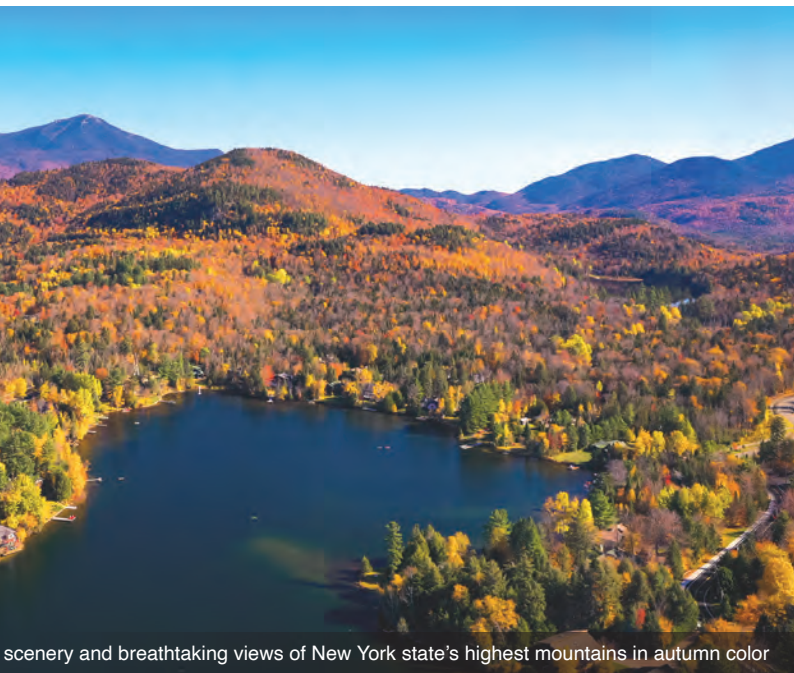
scenery and breathtaking views of New York state's highest mountains in autumn color