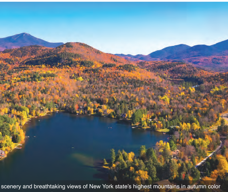
scenery and breathtaking views of New York state's highest mountains in autumn color