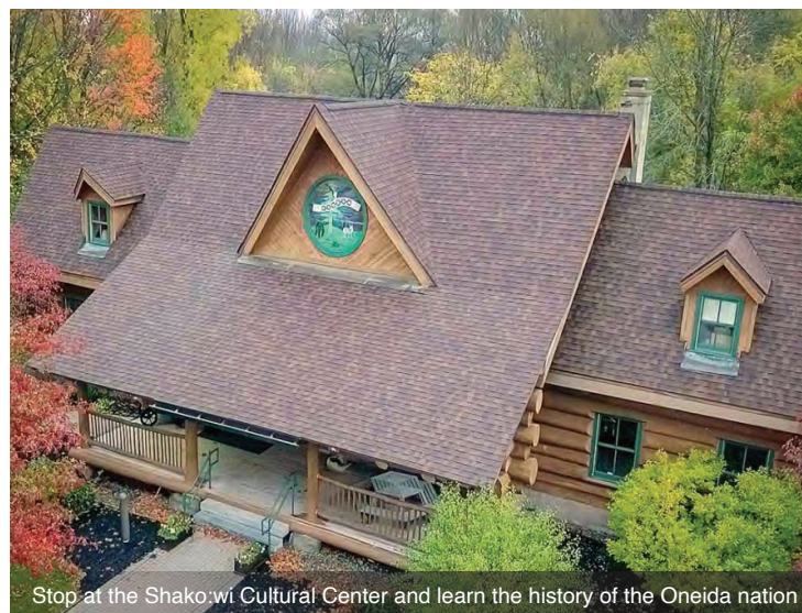
Stop at the Shako:wi Cultural Center and learn the history of the Oneida nation

DAY 8 Return Home: This morning a group transfer to the Syracuse Hancock International Airport for flights out after 12:00 p.m. Meal: B