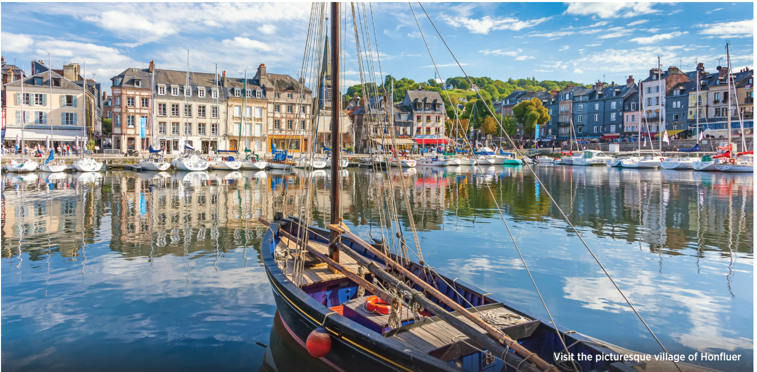
Visit the picturesque village of Honfleur