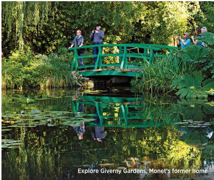
Explore Giverny Gardens, Monet's former home

landed, as well as the memorials and museum, which honor the bravery of those involved and their ultimate sacrifice. Your Star-Ship remains docked in Honfleur overnight. Meals: B, L, D