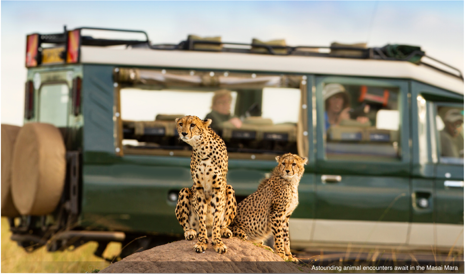
Astounding animal encounters await in the Masai Mara