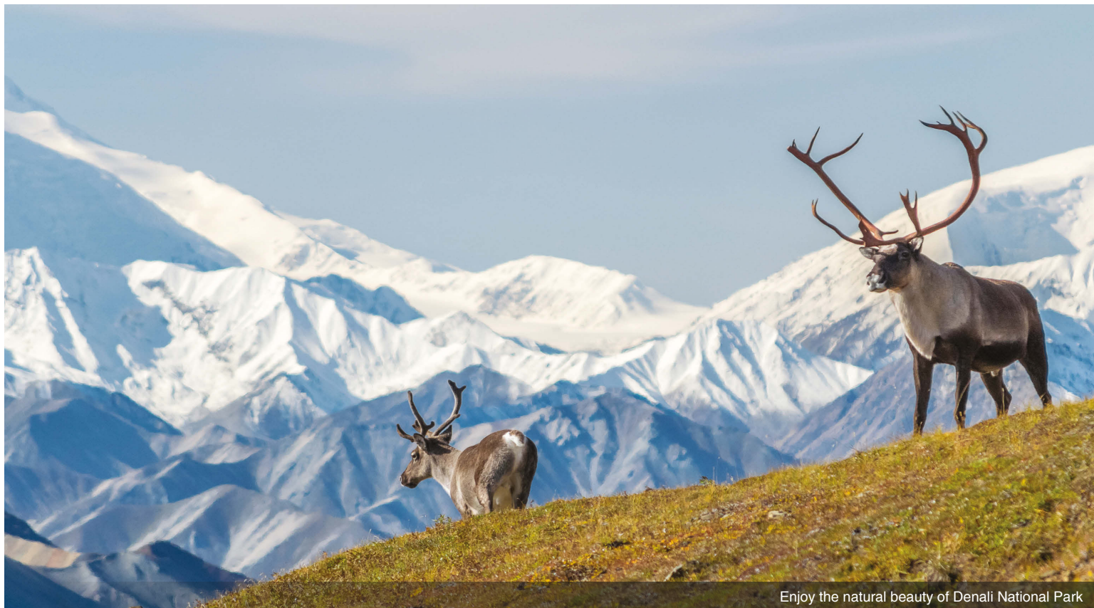
Enjoy the natural beauty of Denali National Park