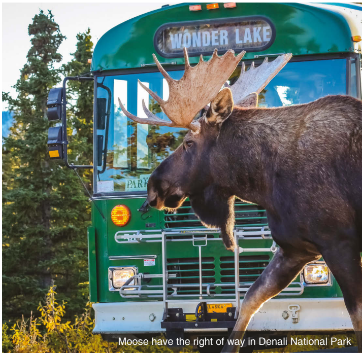
Moose have the right of way in Denali National Park