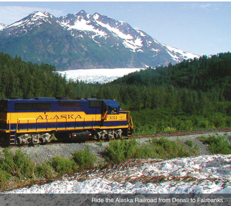
Ride the Alaska Railroad from Denali to Fairbanks

Thompson Pass. You will make a quick stop at Worthington Glacier for a close look at this massive ice floe. Meals: B, D