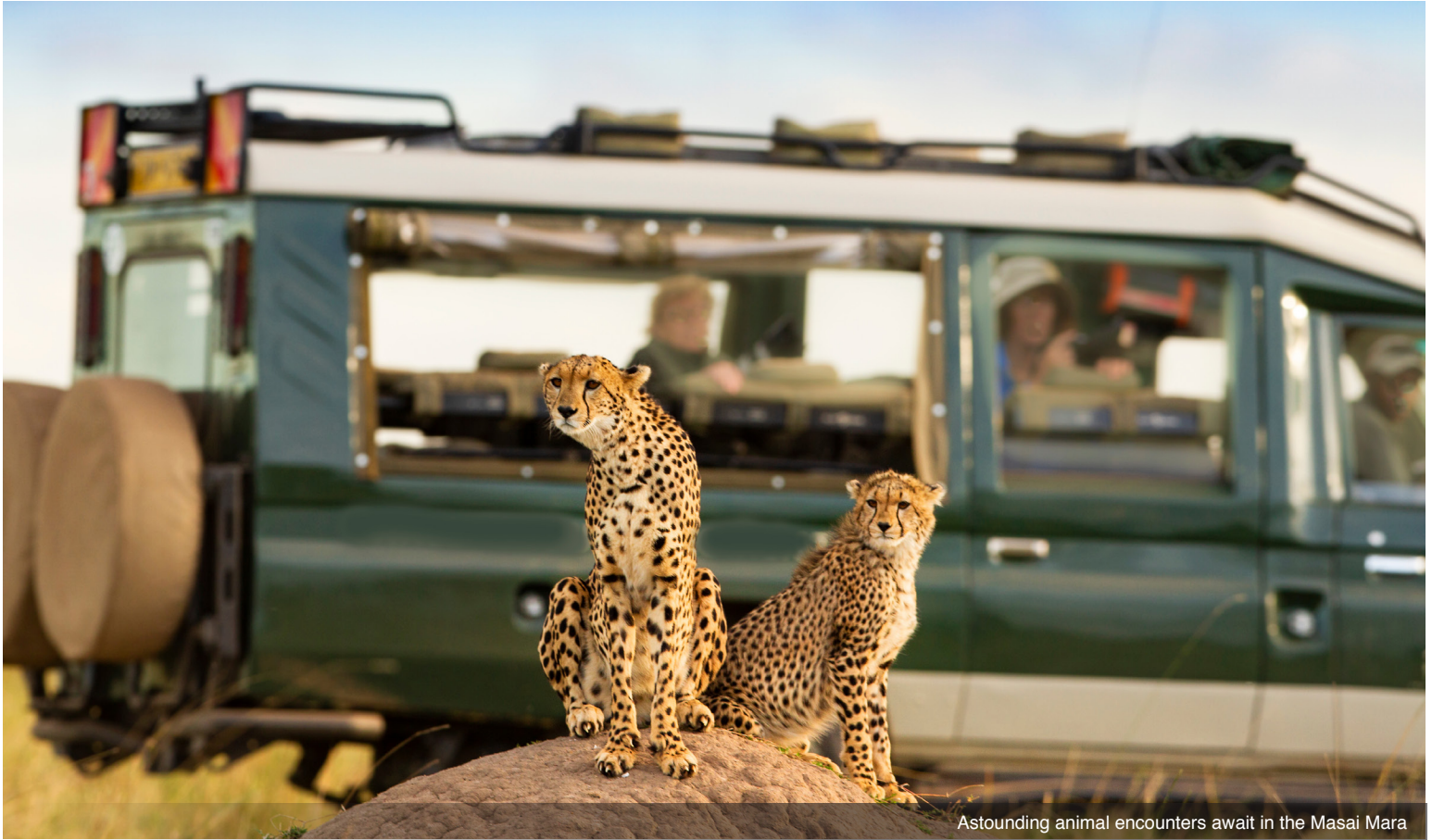
Astounding animal encounters await in the Masai Mara