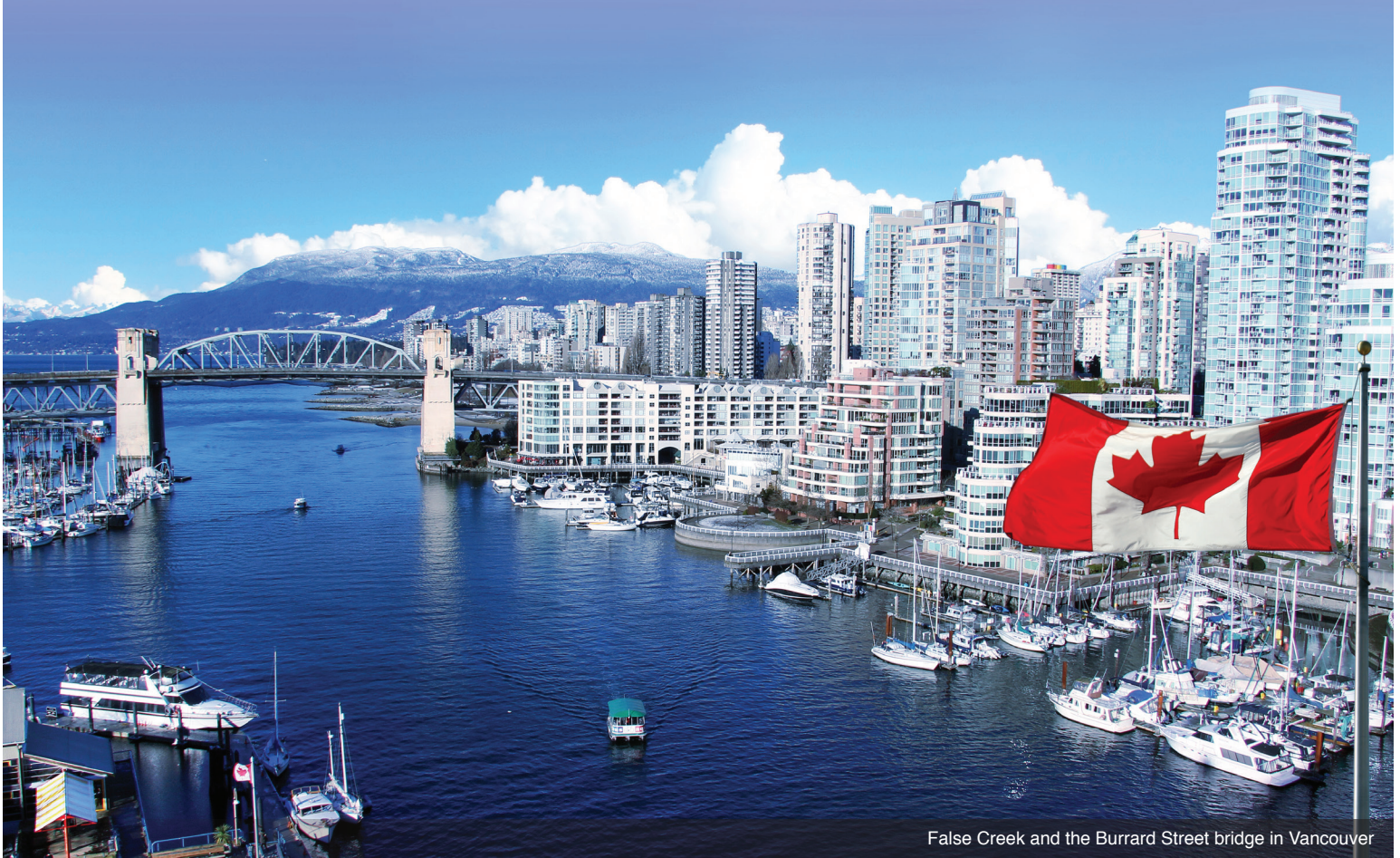
False Creek and the Burrard Street bridge in Vancouver