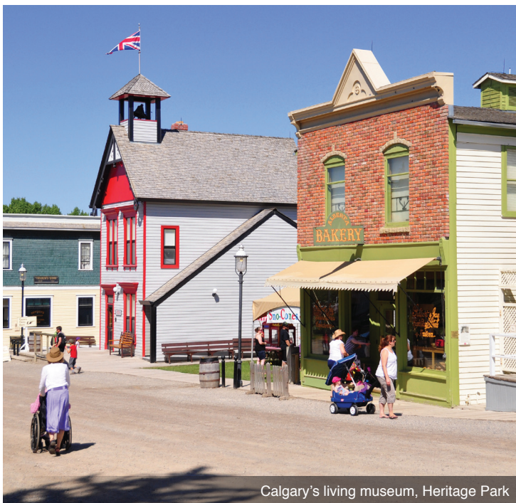
Calgary's living museum, Heritage Park