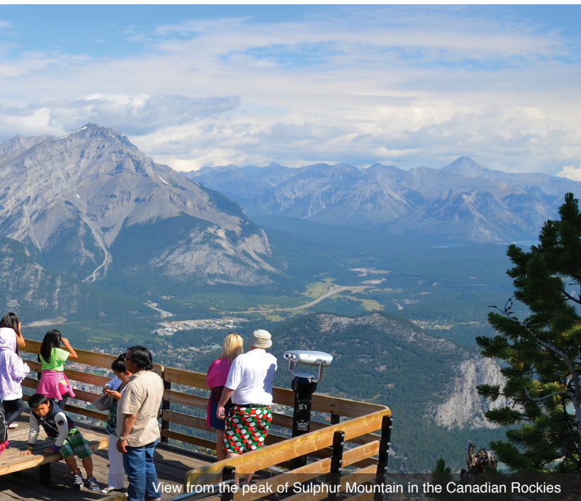
View from the peak of Sulphur Mountain in the Canadian Rockies

DAY 7 Indian Arm Lunch Cruise: Today, climb aboard the luxurious MV Harbour Princess for a remarkable cruise through the Indian Arm, a coastal mountain fjord located right in Vancouver's backyard. Sail the calm inland waters of Vancouver's inner harbor, through Burrard Inlet and into Indian Arm. Once heavily-glaciated, the region features spectacular landscapes with lush green forests, pristine waterfalls, panoramic vistas and wildlife. Enjoy a wonderful buffet lunch while taking in the scenery. Meals: B, L, D