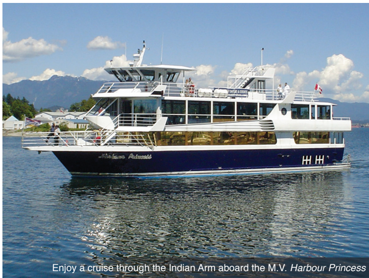
Enjoy a cruise through the Indian Arm aboard the M.V. Harbour Princess

DAY 8 Return Home: Following breakfast, depart Canada with a transfer to the Vancouver Airport for flights out today. Meal: B