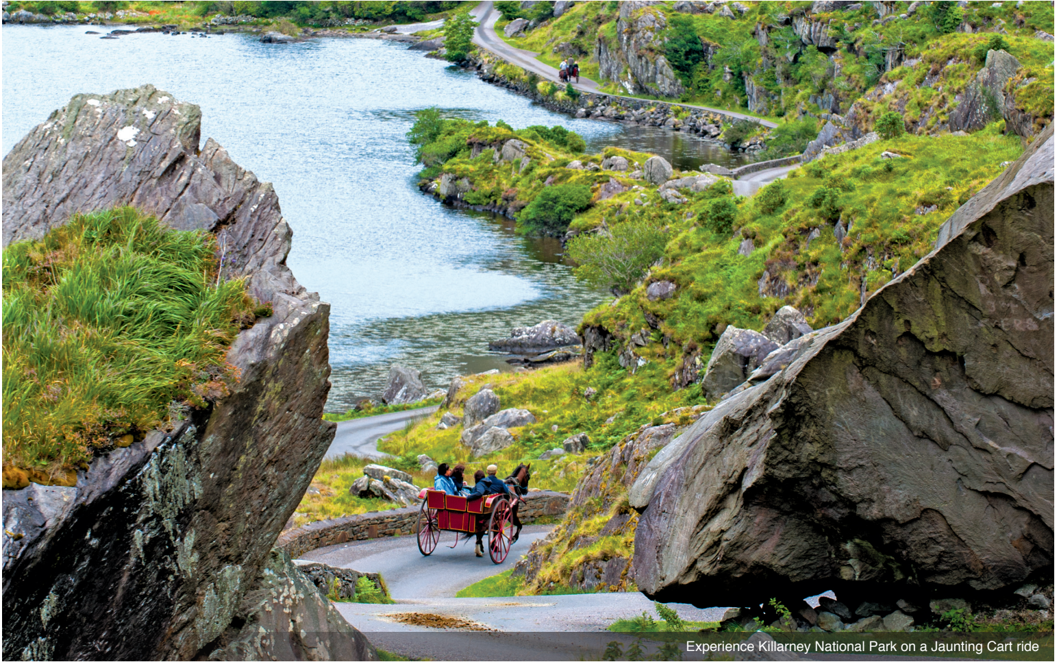
Experience Killarney National Park on a Jaunting Cart ride