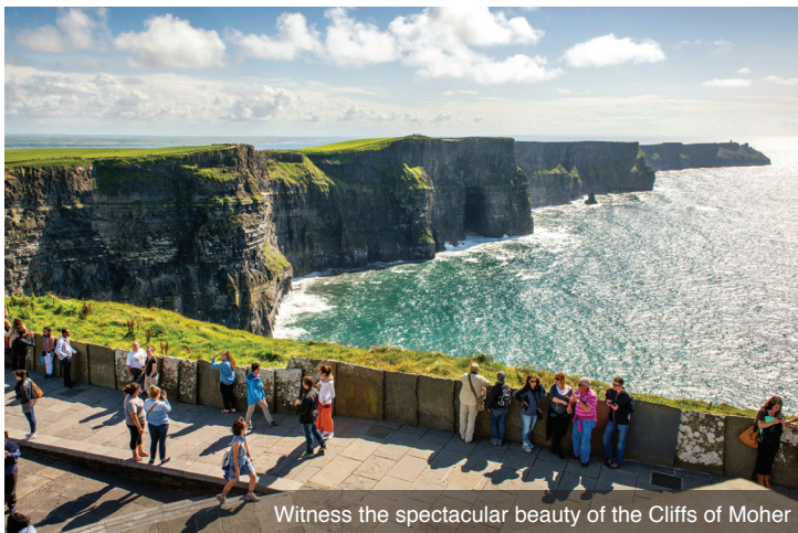
Witness the spectacular beauty of the Cliffs of Moher