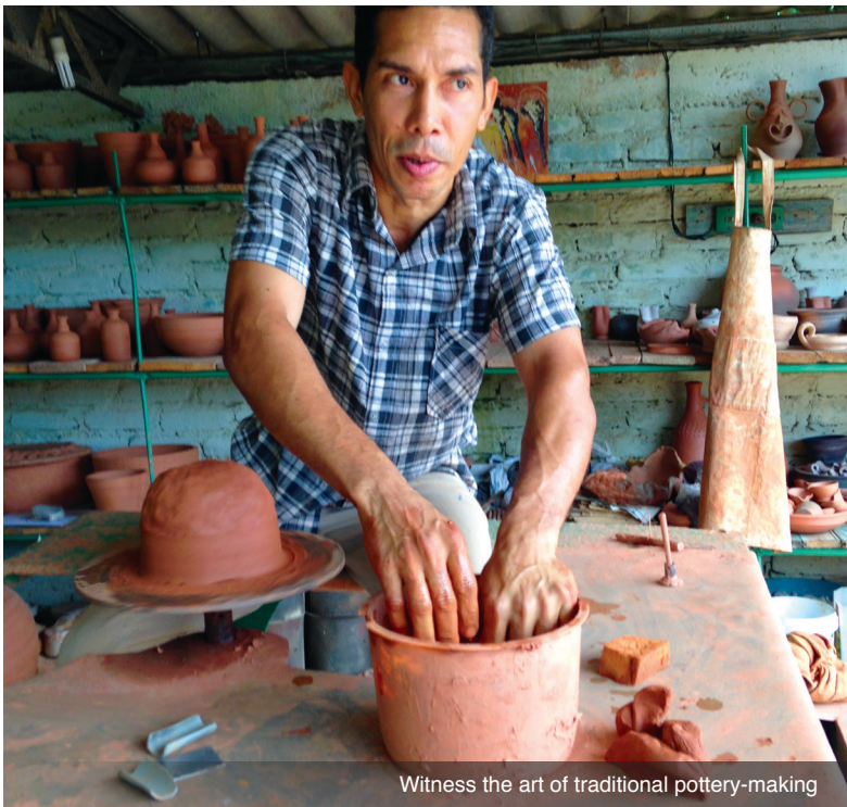
Witness the art of traditional pottery-making

DAY 5 Havana / Trinidad: It's time to depart Havana and journey by coach to the colonial city of Trinidad. En route, visit the town of Cienfuegos. A walking tour around the center of the town showcases its historic and architectural sites as well as affording the opportunity to interact with residents and vendors who are happy to share their stories of a quiet lifestyle. While visiting the Tomás Terry Theatre, declared a national monument, see its ornate interior with Carrara marble, hand-carved wooden flooring, gold-leaf mosaics, and ceiling frescos. After lunch at a paladar, continue to Trinidad for dinner at the hotel and the final two nights of the program. Meals: B, L, D