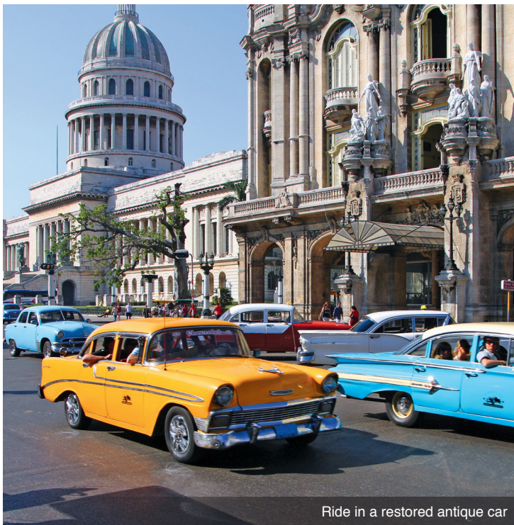
Ride in a restored antique car