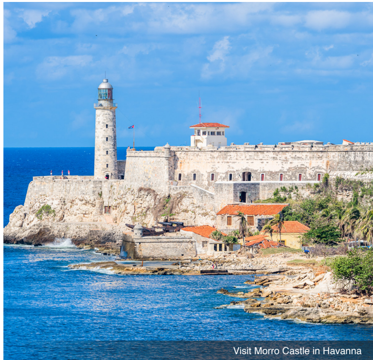
Visit Morro Castle in Havana

DAY 1 USA / Havana, Cuba: Depart the USA on your flight to Havana, Cuba. Upon arrival, you will be met at the airport by a local representative of Mayflower, assisted with arrival procedures, then transferred to the hotel. Your Tour Guide will be available at the hotel for any information you may need as you settle in for your visit to Havana.