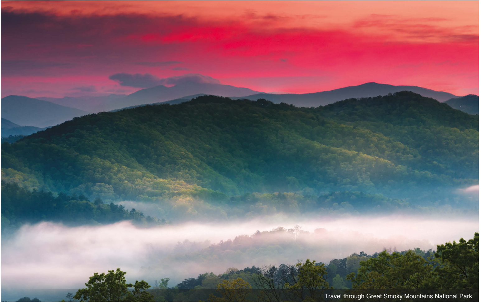
Travel through Great Smoky Mountains National Park