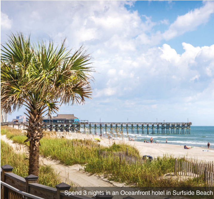
Spend 3 nights in an Oceanfront hotel in Surfside Beach