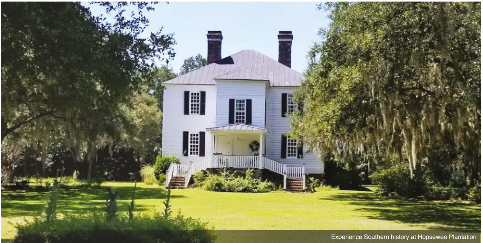
Experience Southern history at Hopsewee Plantation

Hammock Shops Village, a collection of Lowcountry arts, crafts, gifts and of course, hand-made hammocks. Tonight, you are treated to another of Myrtle Beach's best shows.