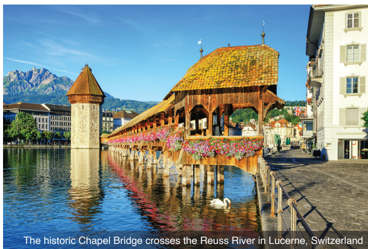
The historic Chapel Bridge crosses the Reuss River in Lucerne, Switzerland