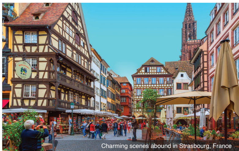
Charming scenes abound in Strasbourg, France

DAY 1 Depart the USA: Today you'll depart the USA on your overnight flight to Zurich, Switzerland.