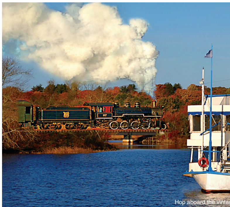
Hop aboard the vintage

DAY 1 Arrive in Boston: Arrive in Boston, Massachusetts with an included transfer to your hotel. Meet your Tour Manager in the hotel lobby at 6:00 p.m. for a welcome dinner. Meal: D