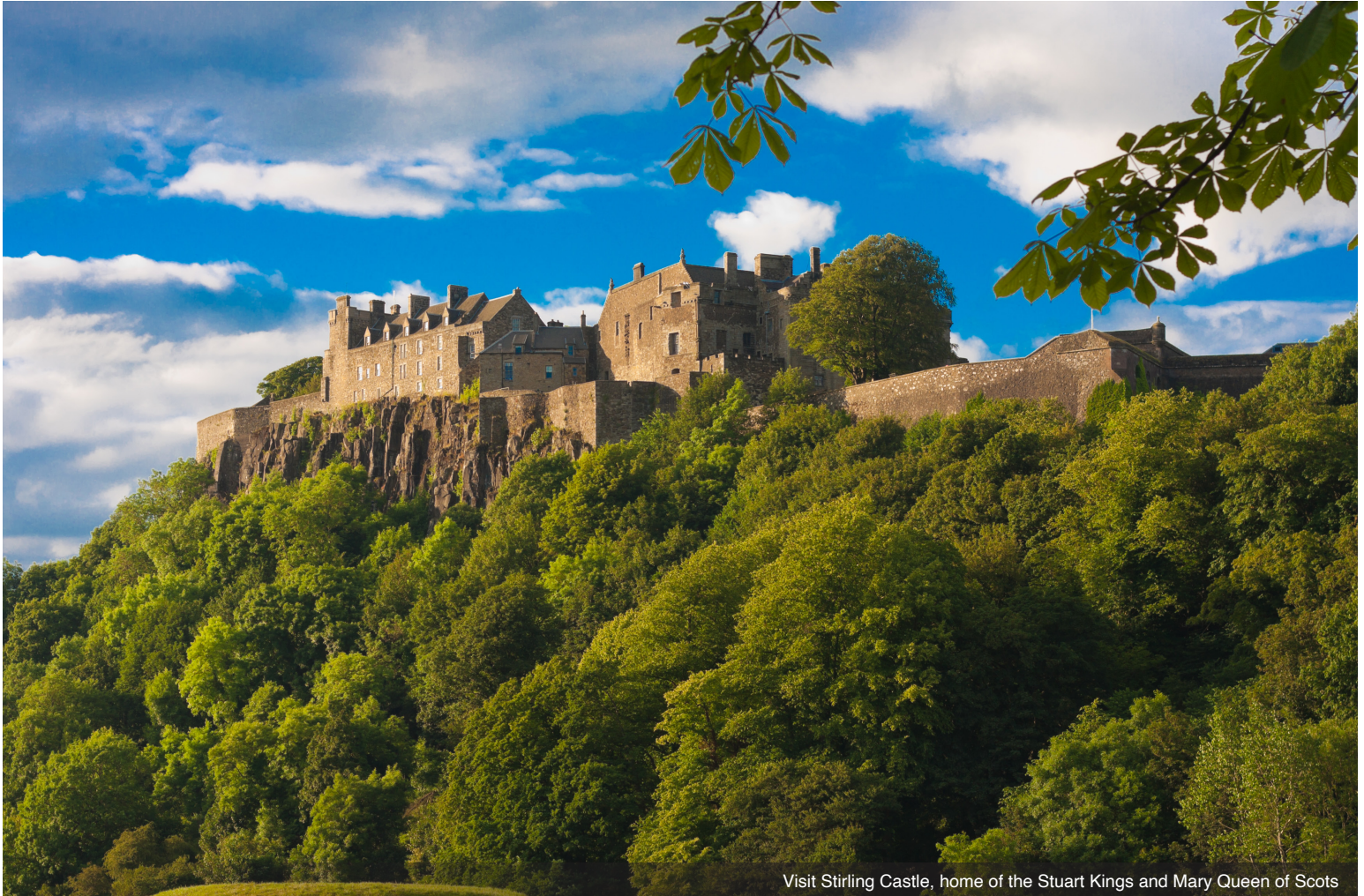
Visit Stirling Castle, home of the Stuart Kings and Mary Queen of Scots