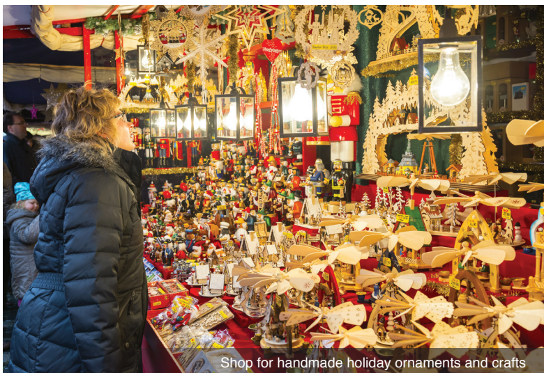
Shop for handmade holiday ornaments and crafts

Days 2 through 8 – Aboard an Emerald Cruises Star-Ship