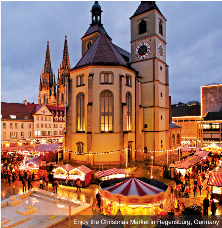
Enjoy the Christmas Market in Regensburg, Germany