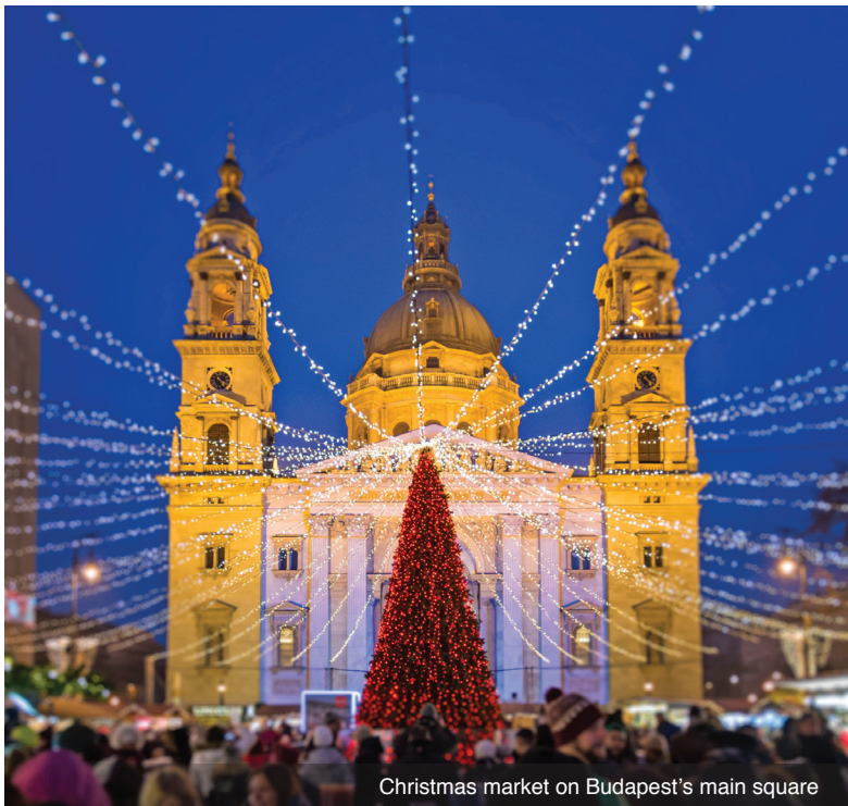
Christmas market on Budapest's main square

boutiques and theaters, among them the State Opera House. This evening you'll be delighted by a traditional Hungarian folklore show onboard. Meals: B, L, D