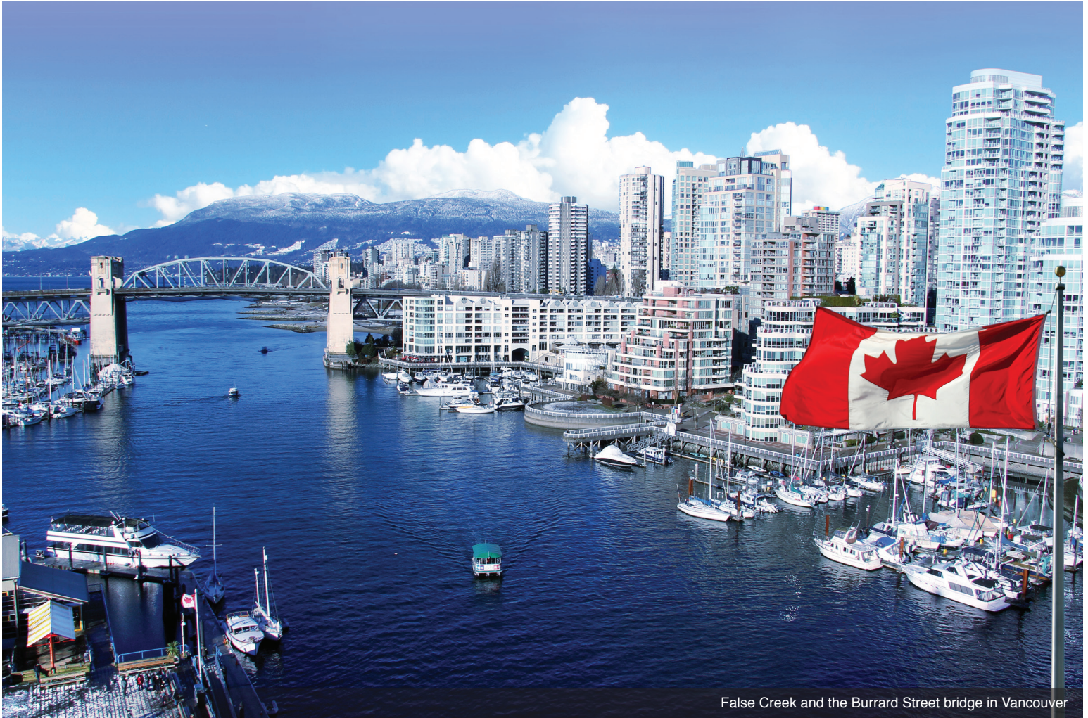
False Creek and the Burrard Street bridge in Vancouver