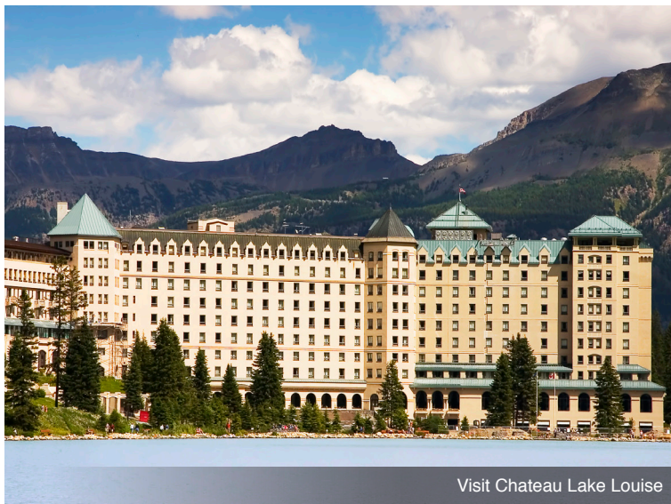
Visit Chateau Lake Louise

DAY 8 Return Home: Following breakfast, depart Canada with a transfer to the Vancouver Airport for flights out today. Meal: B