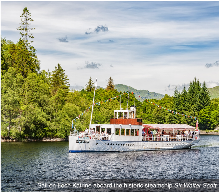
Sail on Loch Katrine aboard the historic steamship Sir Walter Scott