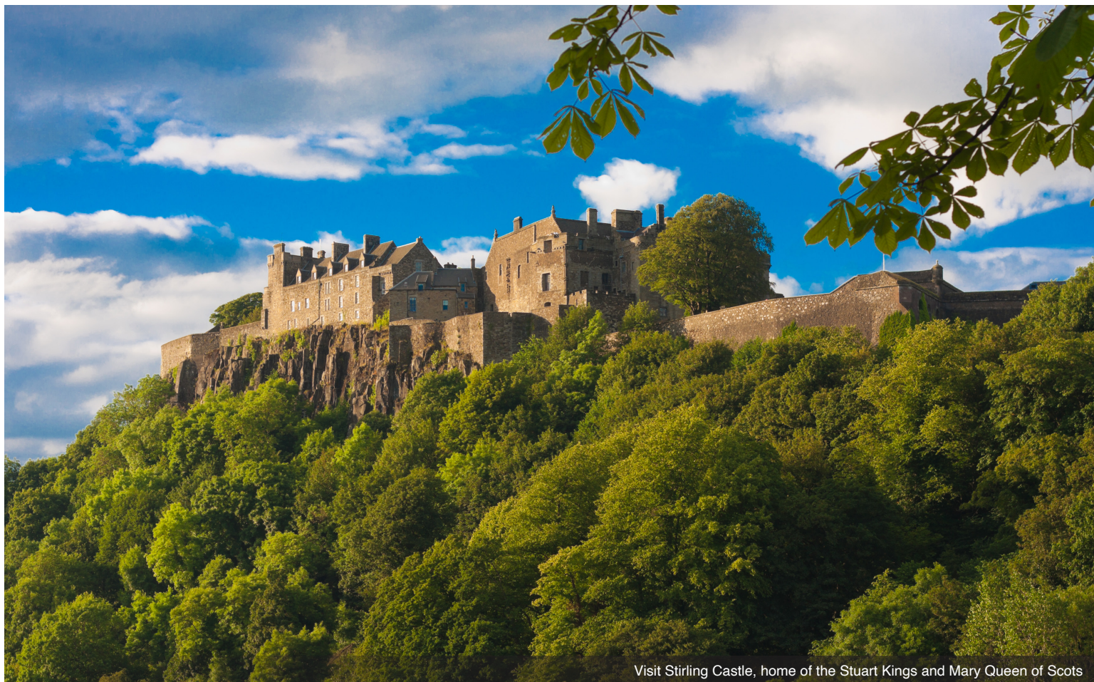
Visit Stirling Castle, home of the Stuart Kings and Mary Queen of Scots