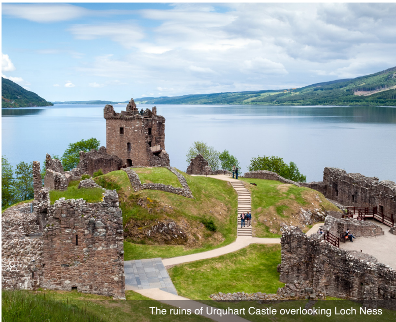
The ruins of Urquhart Castle overlooking Loch Ness

with dramatic scenery and striking architecture. During the panoramic city tour, see the historic Old Town and the elegant Georgian New Town, both UNESCO World Heritage Sites. Visit the city's icon, Edinburgh Castle, perched high atop a hill, offering panoramic views of stately mountains, rolling hills and lovely countryside. Inside the castle, stand in awe of the Scottish Crown Jewels, featuring the crown, sword, and scepter, which are among the oldest regalia in Europe. After free time for lunch on your own, depart for Roslin, a tiny village outside Edinburgh, where you visit Rosslyn Chapel. This 15th-century church is famous for its decorative art and mysterious associations with the Knights Templar and the Holy Grail. This evening, dinner is included. Meals: B, D