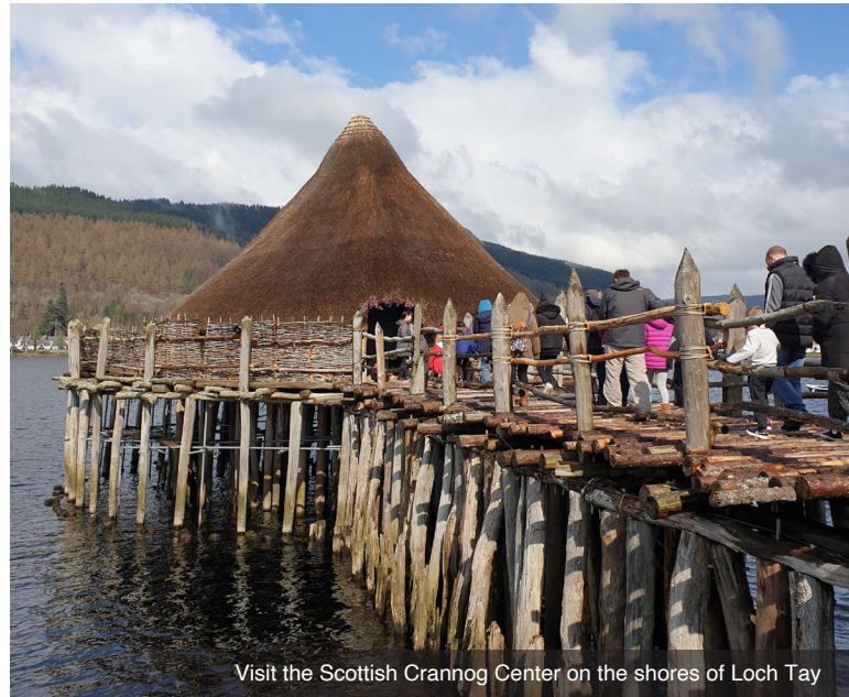
Visit the Scottish Crannog Center on the shores of Loch Tay

DAY 1 Depart the USA: Depart your gateway city on an overnight flight to Glasgow, Scotland.