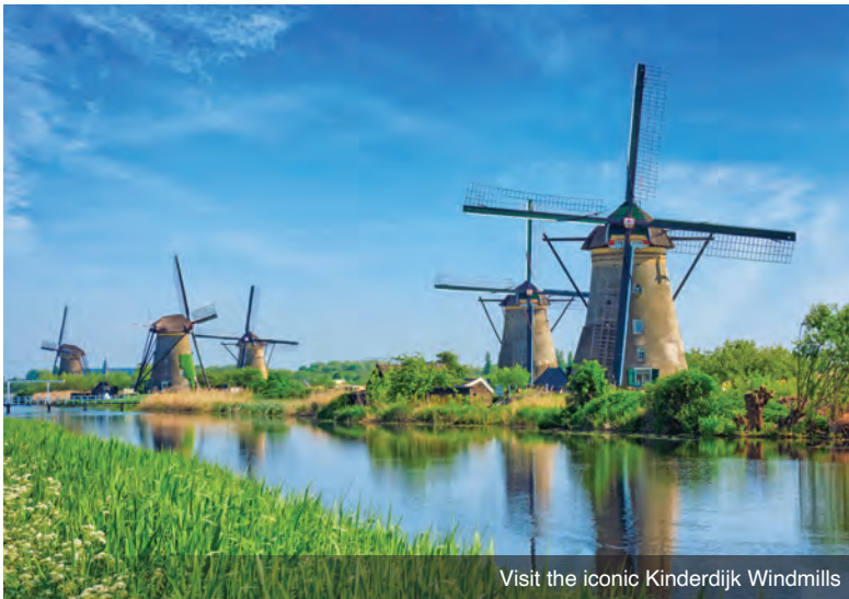
Visit the iconic Kinderdijk Windmills

DAY 9 Koblenz: Wonderfully maintained inside and out, Marksburg Castle boasts a selection of typical interiors including the castle kitchen, the knight's hall, the armoury and an inviting wine cellar. The attractive light-stoned walls of the castle are protected by an outer fortress. With a single tower peering over the turrets and castle walls, it resembles something you would find in a Brothers Grimm tale. Meals: B, L, D