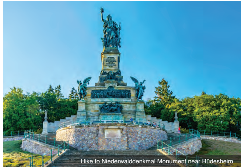
Hike to Niederwalddenkmal Monument near Rudesheim

DAY 1 Depart the USA: Depart the USA on your overnight flight to Zurich, Switzerland.