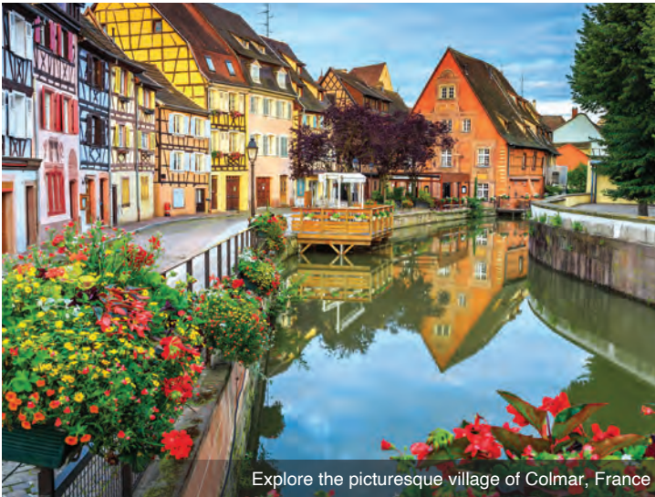
Explore the picturesque village of Colmar, France