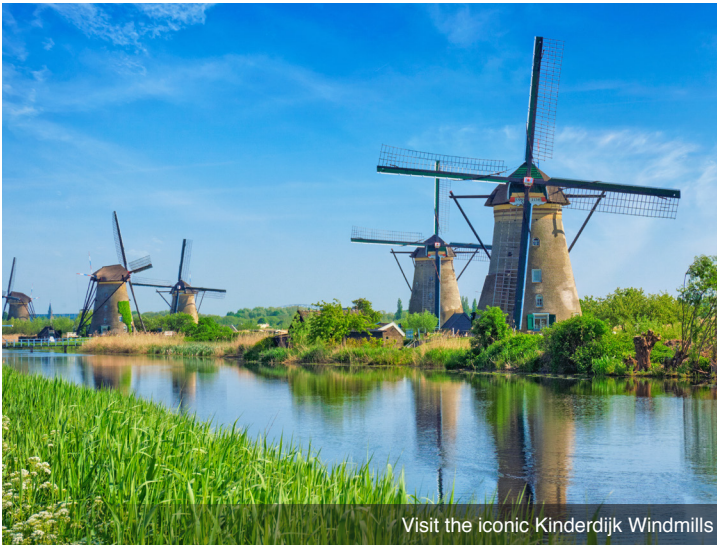
Visit the iconic Kinderdijk Windmills