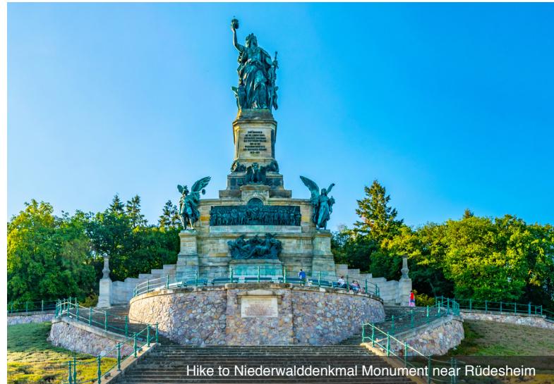
Hike to Niederwalddenkmal Monument near Rüdesheim

DAY 1 Depart the USA: Depart the USA on your overnight flight to Amsterdam, the Netherlands.