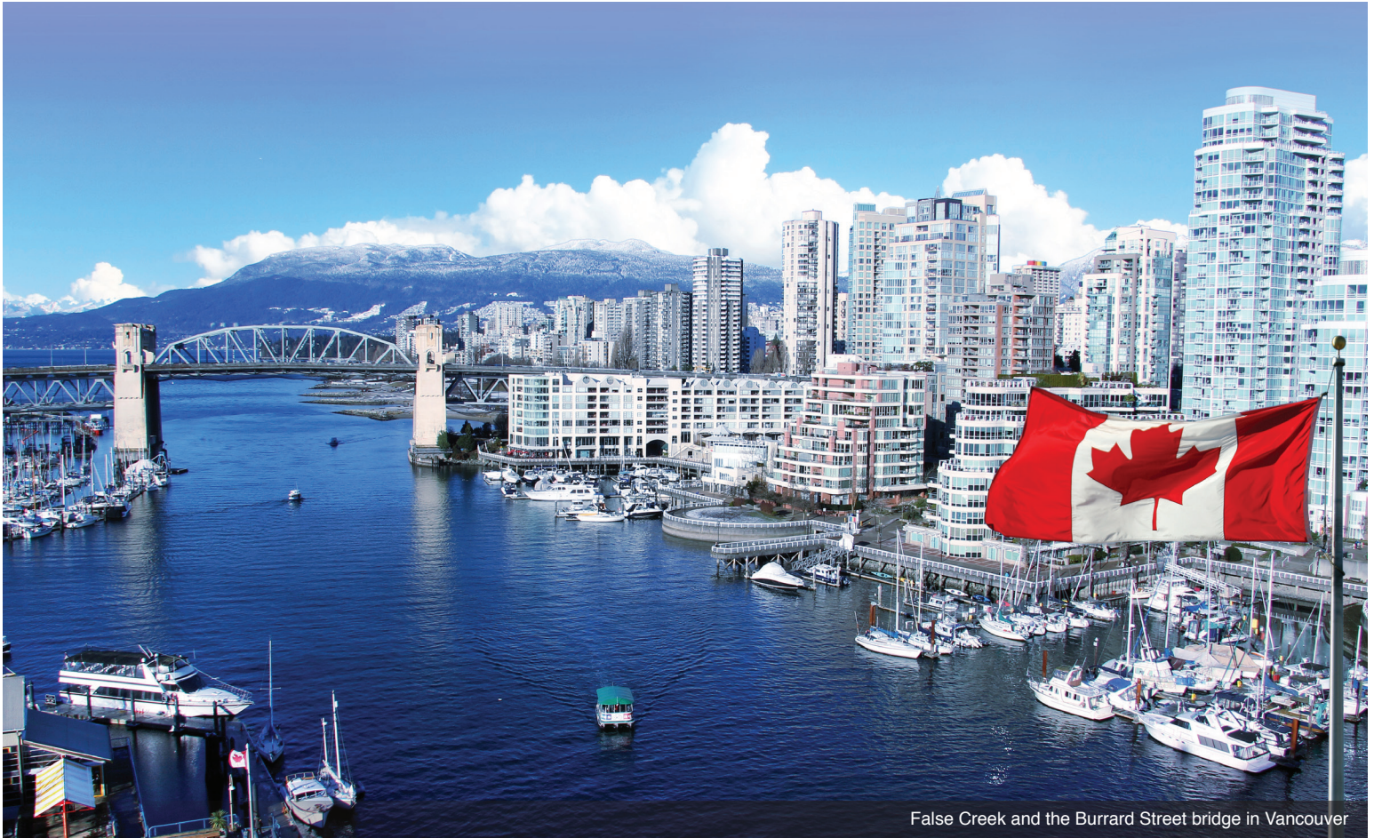
False Creek and the Burrard Street bridge in Vancouver