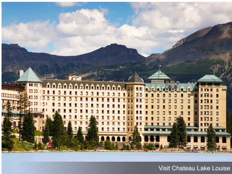
Visit Chateau Lake Louise

DAY 8 Return Home: Following breakfast, depart Canada with a transfer to the Vancouver Airport for flights out today. Meal: B