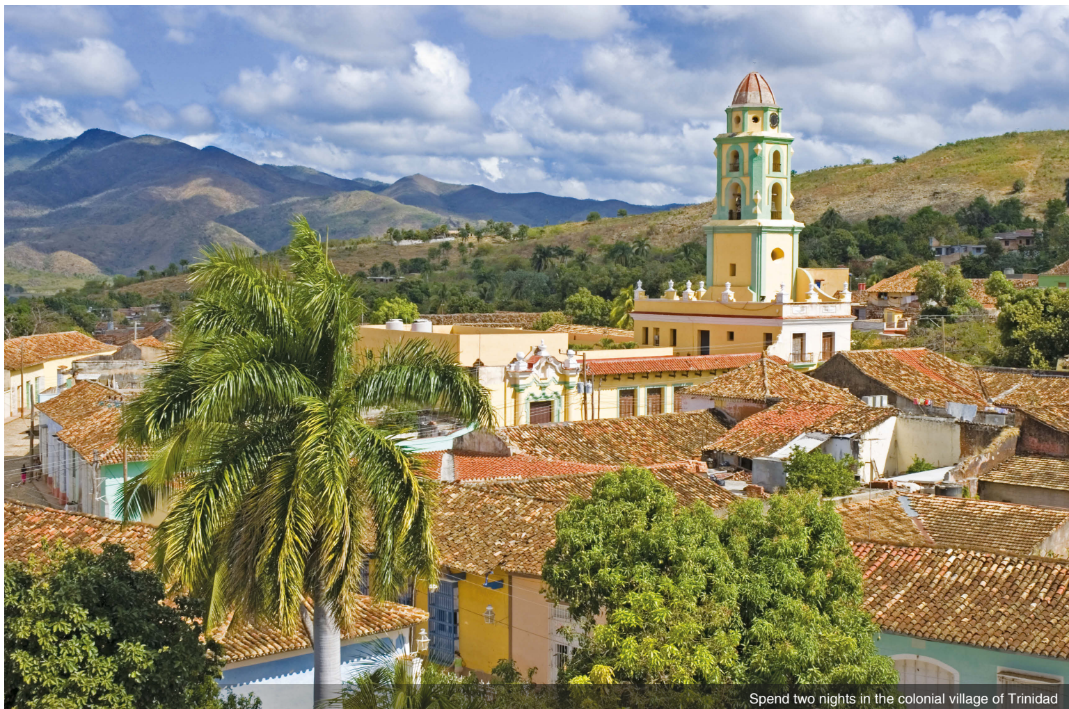
Spend two nights in the colonial village of Trinidad