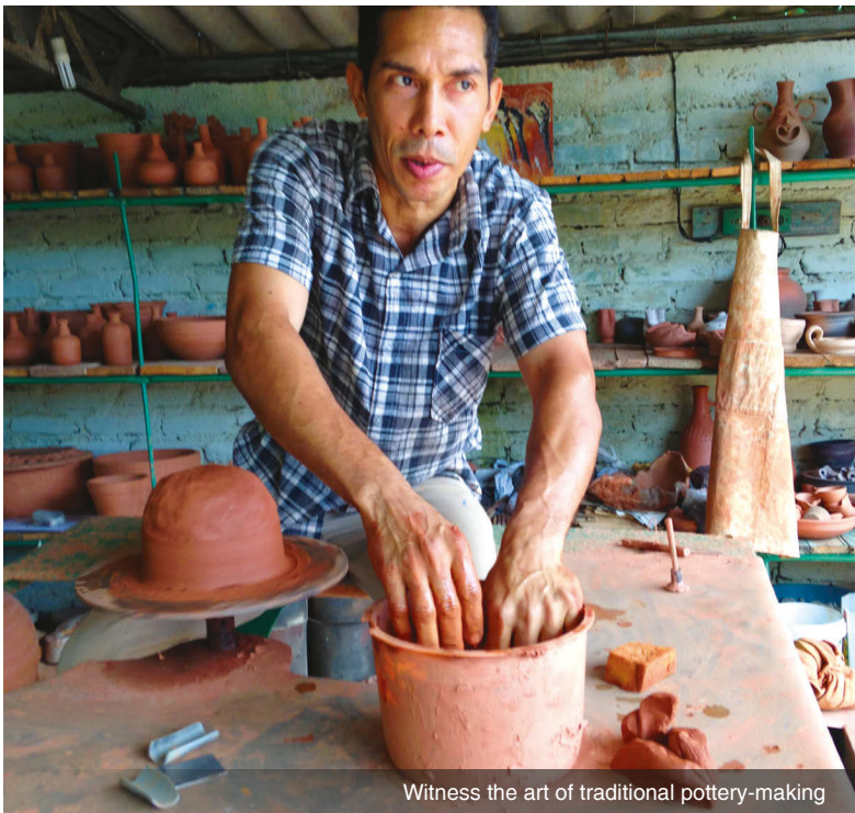
Witness the art of traditional pottery-making

DAY 5 Havana / Trinidad: It's time to depart Havana and journey by coach to the colonial city of Trinidad. En route, visit the town of Cienfuegos. A walking tour around the center of the town showcases its historic and architectural sites as well as affording the opportunity to interact with residents and vendors who are happy to share their stories of a quiet lifestyle. While visiting the Tomás Terry Theatre, declared a national monument, see its ornate interior with Carrara marble, hand-carved wooden flooring, gold-leaf mosaics, and ceiling frescos. After lunch at a paladar, continue to Trinidad for dinner at the hotel and the final two nights of the program. Meals: B, L, D