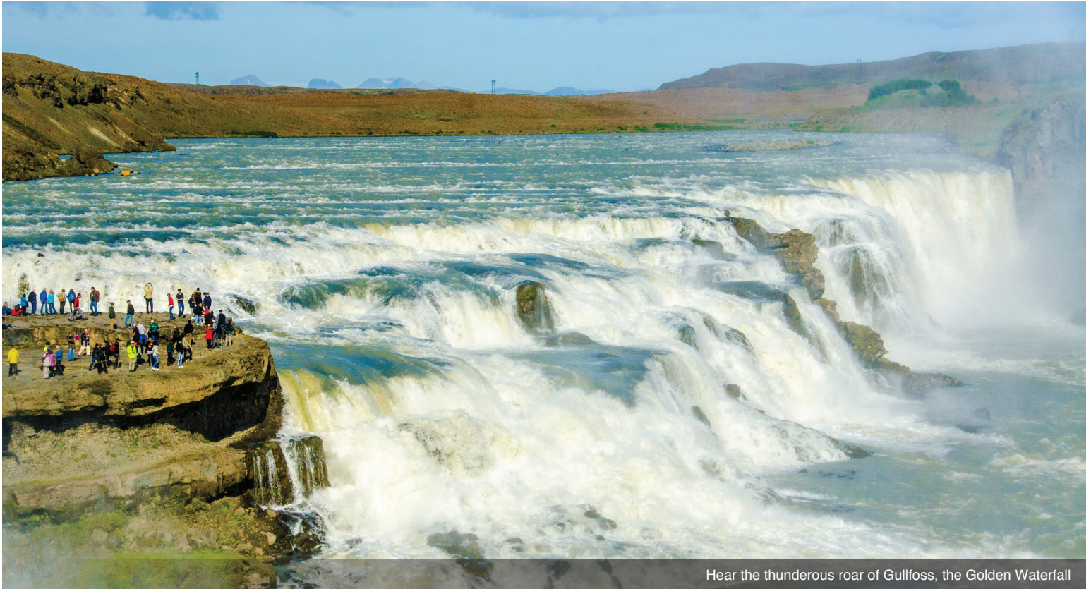
Hear the thunderous roar of Gullfoss, the Golden Waterfall