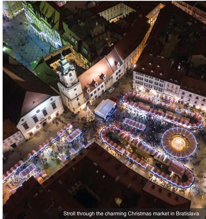
Stroll through the charming Christmas market in Bratislava

DAY 1 Depart the USA: Depart the USA on your overnight flight to Vienna, Austria.