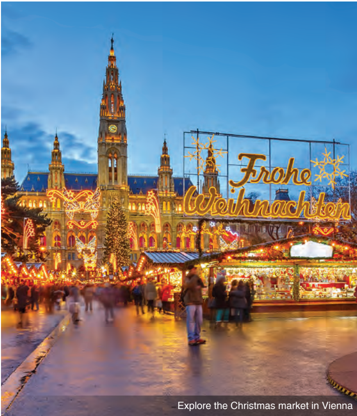
Explore the Christmas market in Vienna