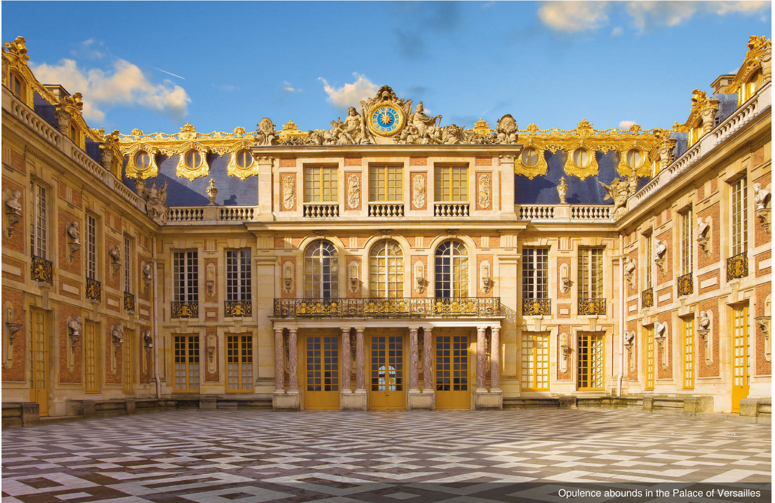
Opulence abounds in the Palace of Versailles