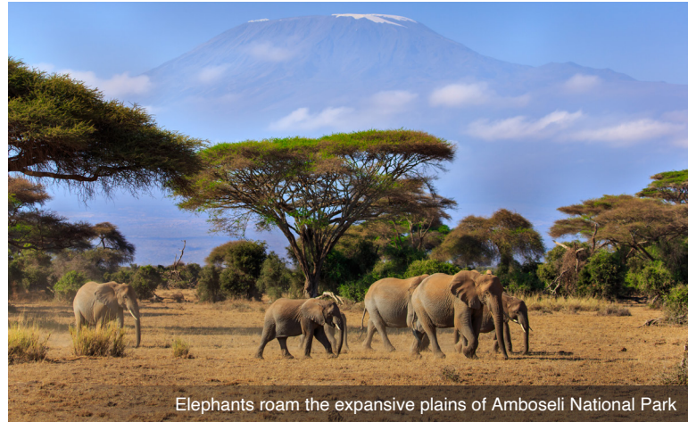
Elephants roam the expansive plains of Amboseli National Park

DAY 1 Depart the USA: Depart the USA on your overnight flight to Nairobi, the capital and largest city of Kenya.