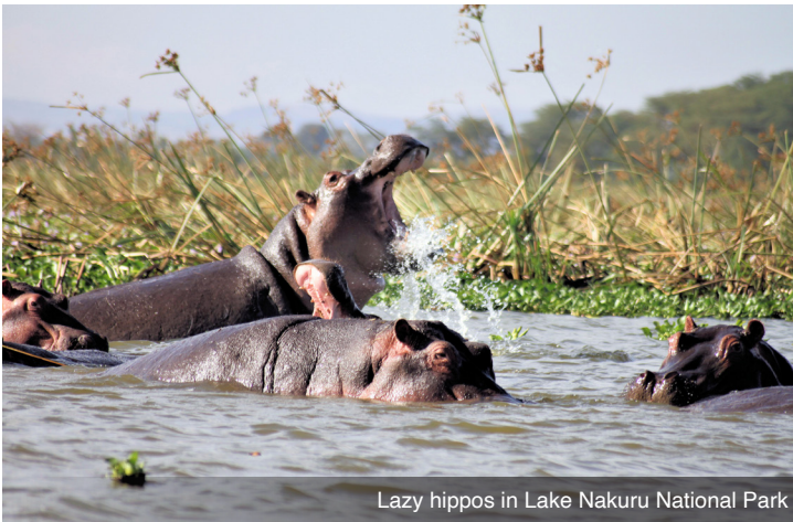
Lazy hippos in Lake Nakuru National Park