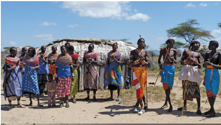
Immerse yourself in the culture of the locals

true to its name. Aside from being spoiled by the variety of wildlife and bird species of the Serengeti, its landscape is stunningly beautiful, especially in the early morning and late evening light. Elephant, buffalo, lion, rhino, zebra, giraffe and others may be spotted during your Serengeti adventure. Meals: B, L, D