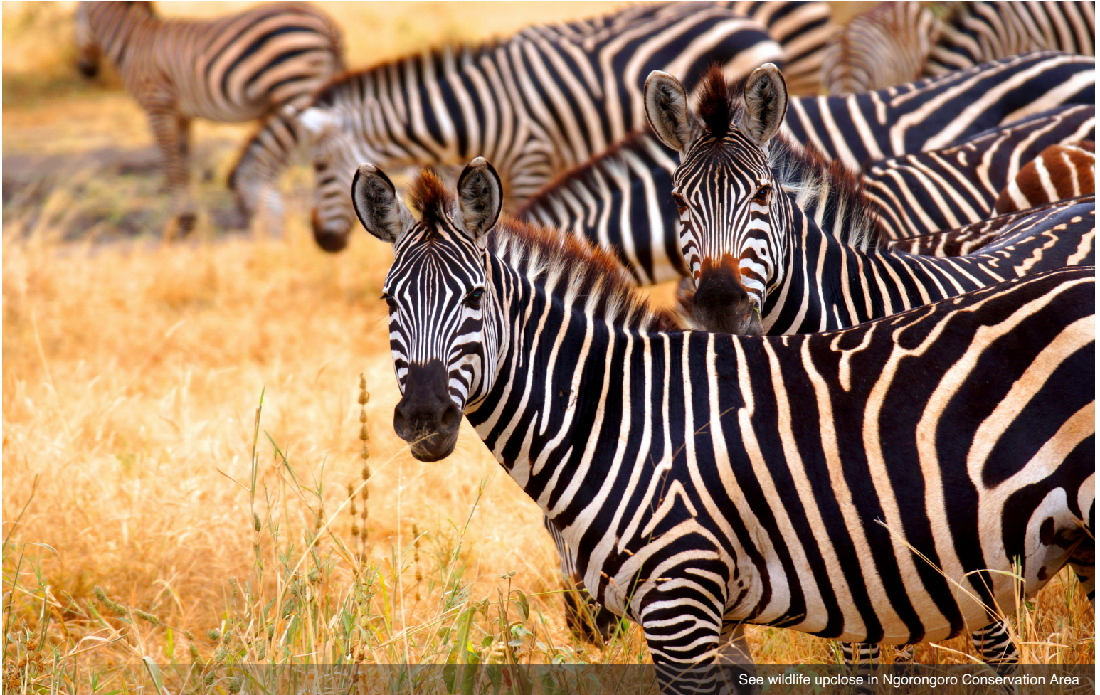
See wildlife upclose in Ngorongoro Conservation Area