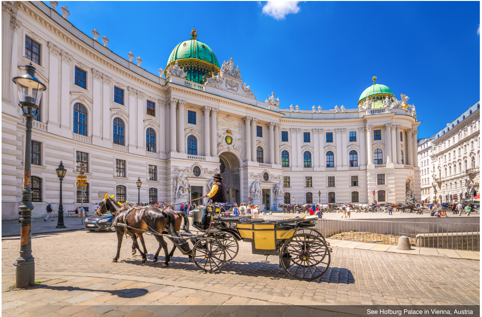
See Hofburg Palace in Vienna, Austria