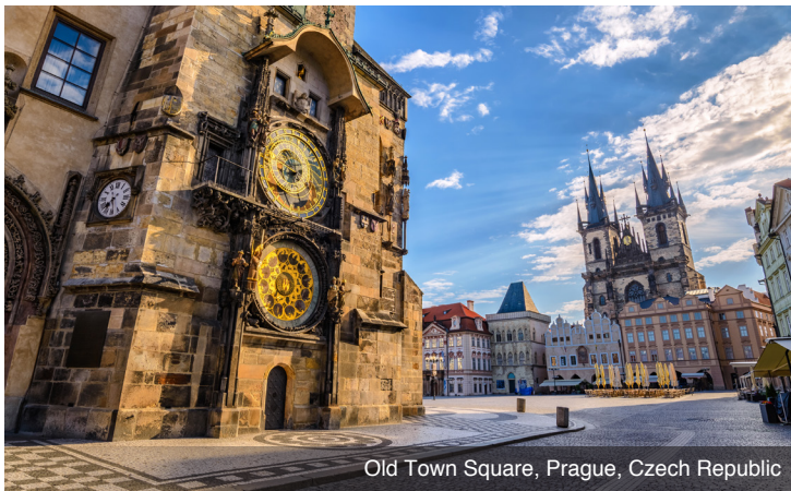
Old Town Square, Prague, Czech Republic