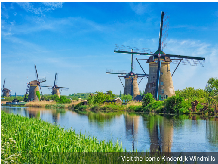
Visit the iconic Kinderdijk Windmills