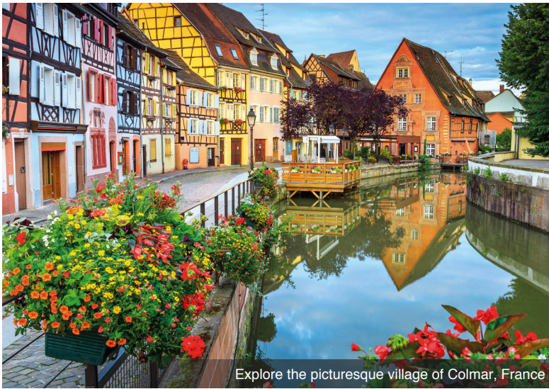
Explore the picturesque village of Colmar, France

DAY 9 Mainz: Your day will start with a guided tour of Mainz and a visit to the impressive sandstone cathedral of the tremendous Old Town. Departing Mainz early afternoon, the remainder of the day is spent cruising along the Rhine to the next port of call. Meals: B, L, D