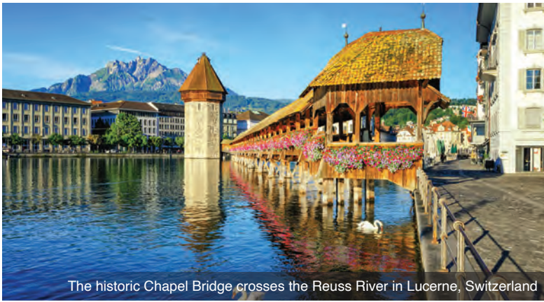
The historic Chapel Bridge crosses the Reuss River in Lucerne, Switzerland

DAY 8 Breisach, Germany: Experience the 'tale of two cities': Breisach, Germany and Neuf-Breisach, France, divided by the Rhine. During the guided visit to these two wonderful gems on the Rhine River, you'll pass the main sights and attractions, including the UNESCO World Heritage fortress overlooking Neuf-Breisach. Meals: B, L, D