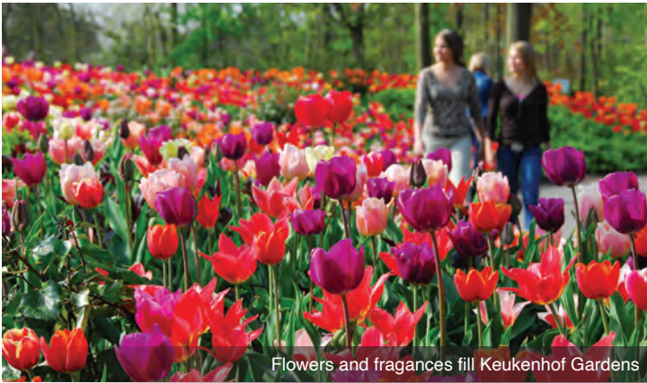
Flowers and fragrances fill Keukenhof Gardens