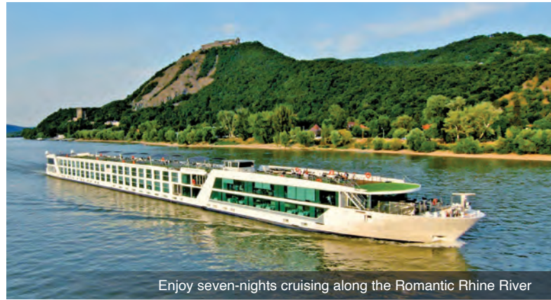
Enjoy seven-nights cruising along the Romantic Rhine River

DAY 1 Depart the USA: Depart the USA on your overnight flight to Amsterdam, the Netherlands.