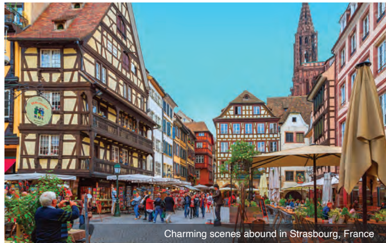
Charming scenes abound in Strasbourg, France

DAY 1 Depart the USA: Today you'll depart the USA on your overnight flight to Zurich, Switzerland.