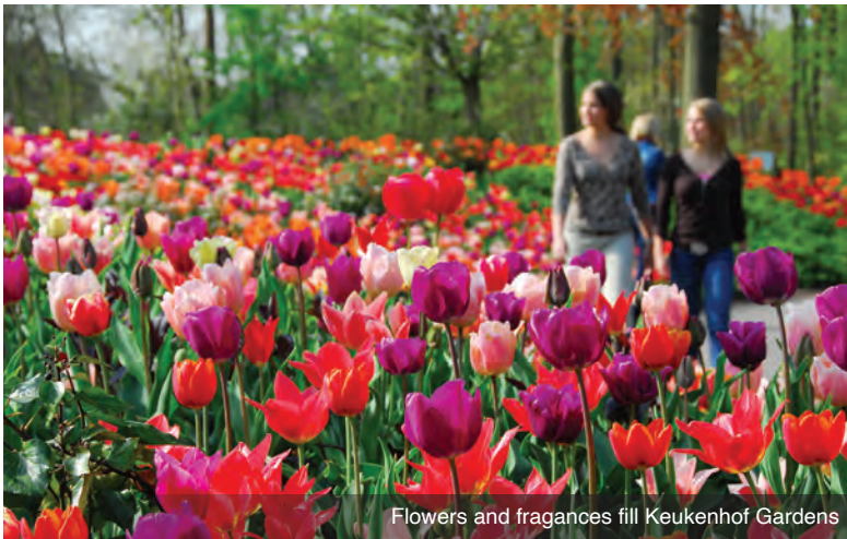
Flowers and fragrances fill Keukenhof Gardens

against the French in the 19th century and later used as a headquarters for the American military during WWII.