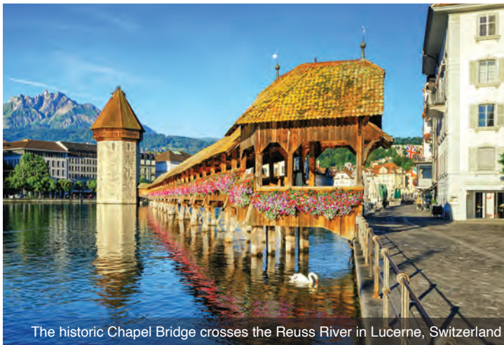
The historic Chapel Bridge crosses the Reuss River in Lucerne, Switzerland