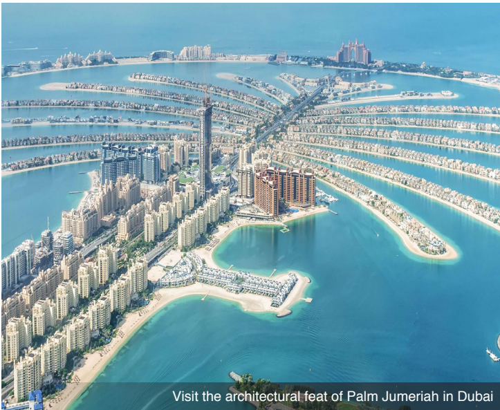
Visit the architectural feat of Palm Jumeriah in Dubai