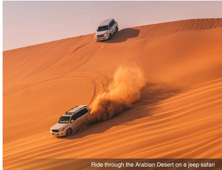
Ride through the Arabian Desert on a jeep safari

DAY 1 Depart the USA: Depart the USA on your overnight flight to Dubai, United Arab Emirates.