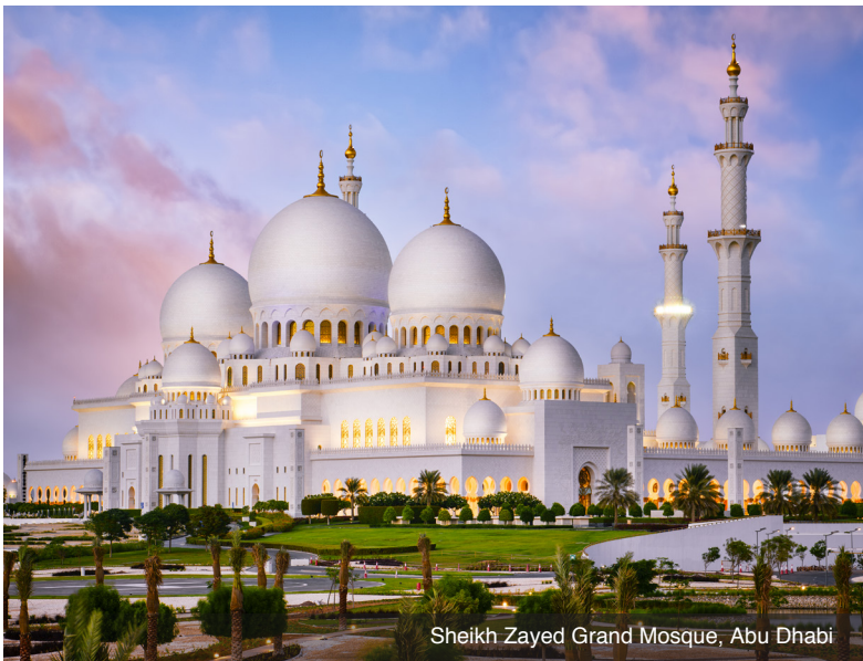
Sheikh Zayed Grand Mosque, Abu Dhabi

Sheikh Zayed Grand Mosque, one of the largest mosques in the world and an example of architectural styles from various Muslim civilizations. Featuring 82 domes, more than 1000 columns, 24-carat gold gilded chandeliers and the world’s largest hand-knotted carpet, this mosque is a place of worship and cultural diversity. At Heritage Village, travel back in time to experience what life was like in the past as you visit this reconstruction of a traditional oasis village. See local items being hand-crafted from pottery to glassblowing and weaving. The traditional Souk resembles a bustling trading hub of days gone by and offers an opportunity to purchase locally made souvenirs. Enjoy a photo stop at Emirates Palace, the opulent, luxury hotel and experience the local flavor of the country with a stop at the Date market to savor the many varieties of dates from the region. Lunch is included at a local restaurant during the day, and dinner is included at the hotel this evening. Meals: B, L, D