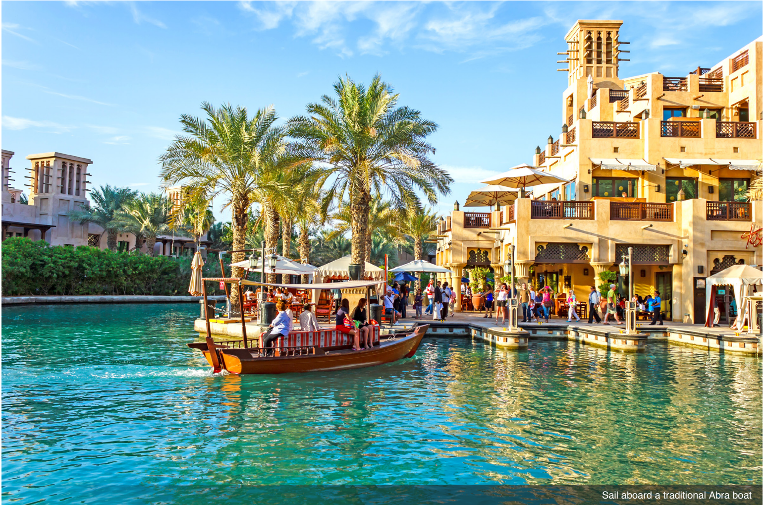
Sail aboard a traditional Abra boat