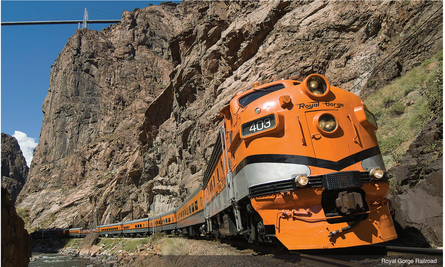
Royal Gorge Railroad