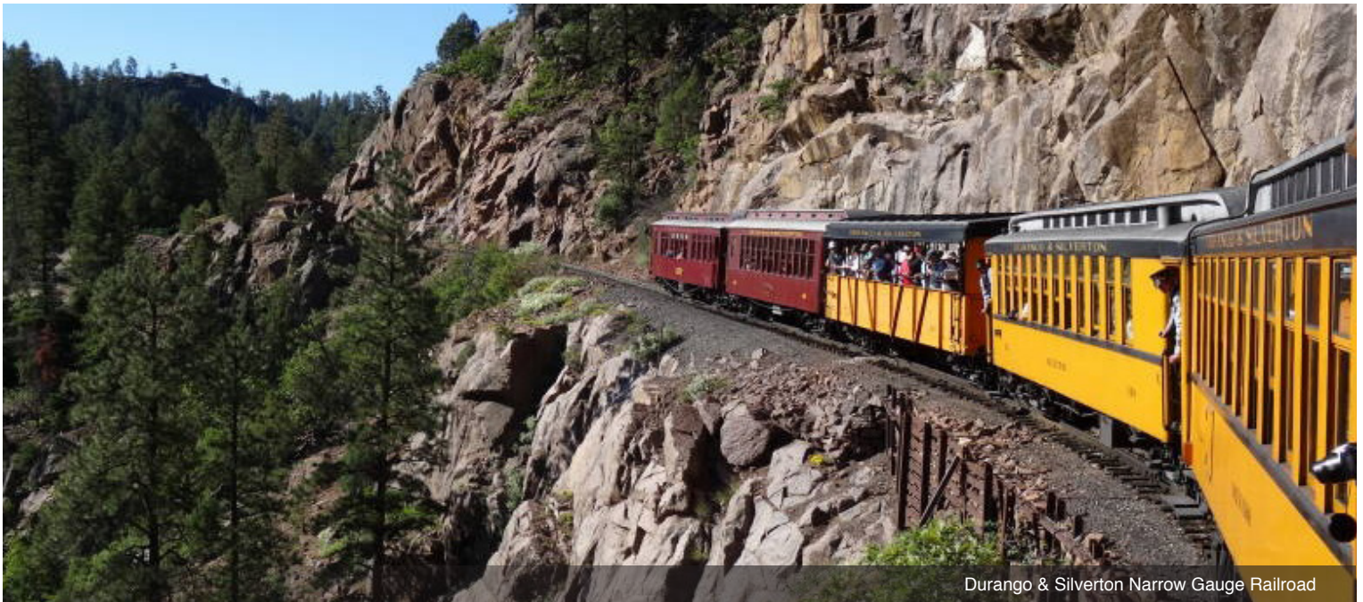
Durango & Silverton Narrow Gauge Railroad

DAY 6 Cumbres & Toltec Scenic Railroad: Your day begins as you board the motorcoach and ride to the Cumbres & Toltec Scenic Railroad, the original Rio Grande Line. This is America's most spectacular narrow gauge steam railroad. Explore 50 miles of wild and rugged territory between Chama, New Mexico and Antonito, Colorado, the highest point on the railroad. Meals: B, L