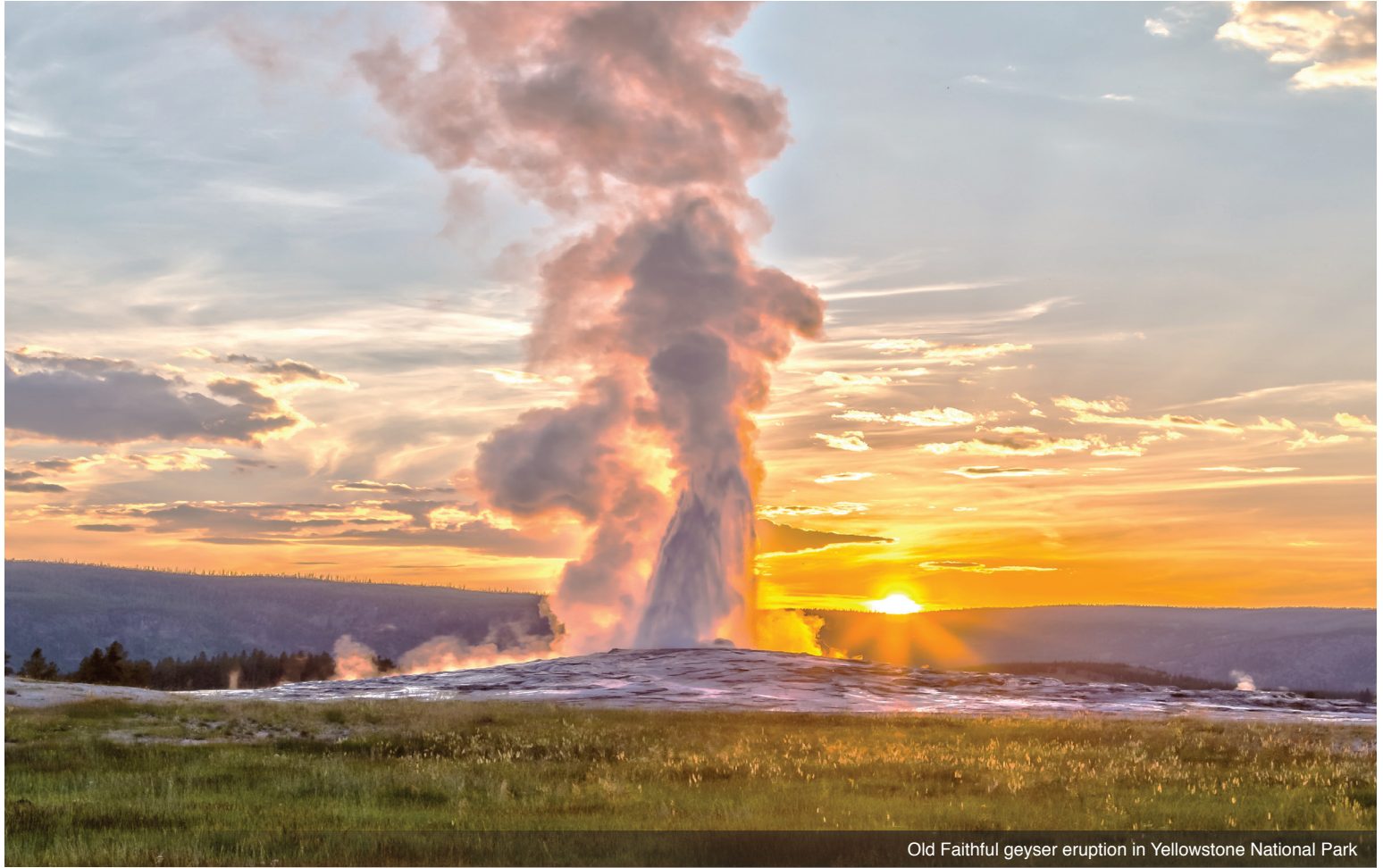
Old Faithful geyser eruption in Yellowstone National Park