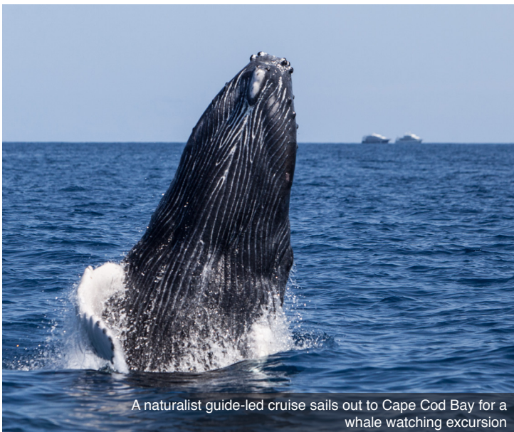
A naturalist guide-led cruise sails out to Cape Cod Bay for a whale watching excursion

DAY 9 Travel Home: This morning, take the group transfer to Boston's Logan Airport for flights out after 12:00 p.m. Meal: B