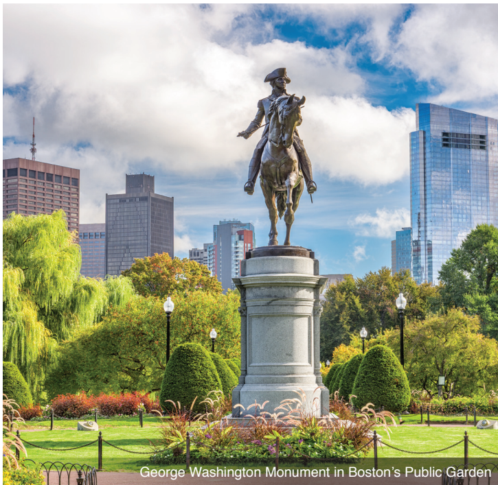
George Washington Monument in Boston's Public Garden