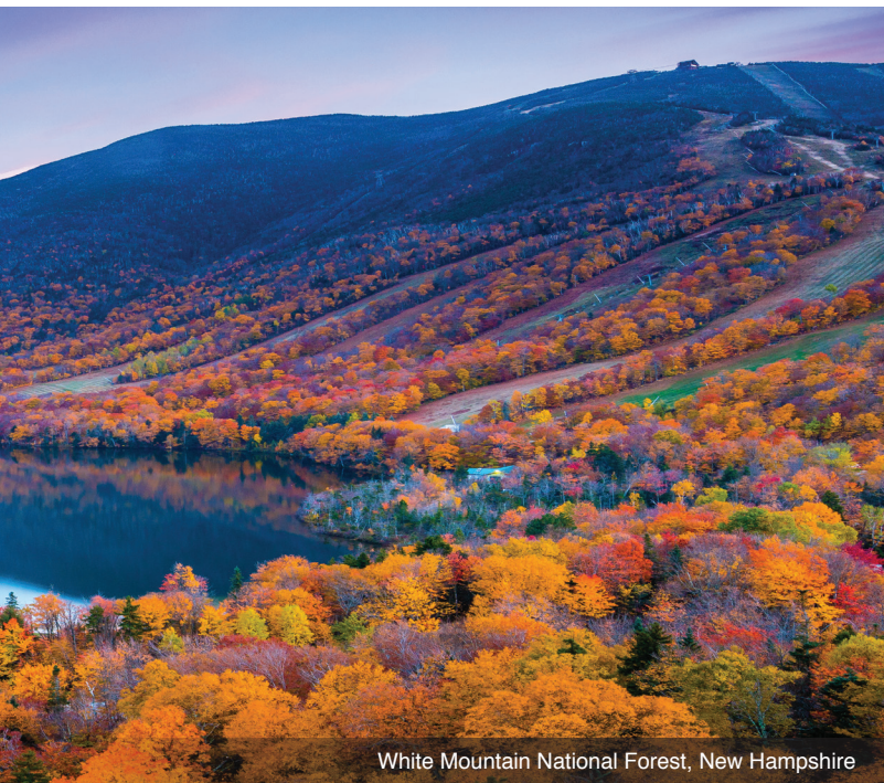
White Mountain National Forest, New Hampshire