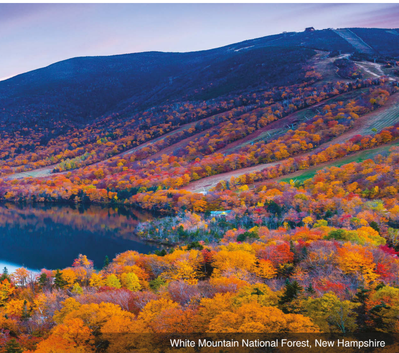
White Mountain National Forest, New Hampshire