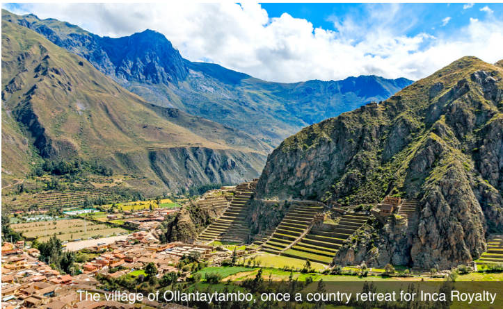
The village of Ollantaytambo, once a country retreat for Inca Royalty