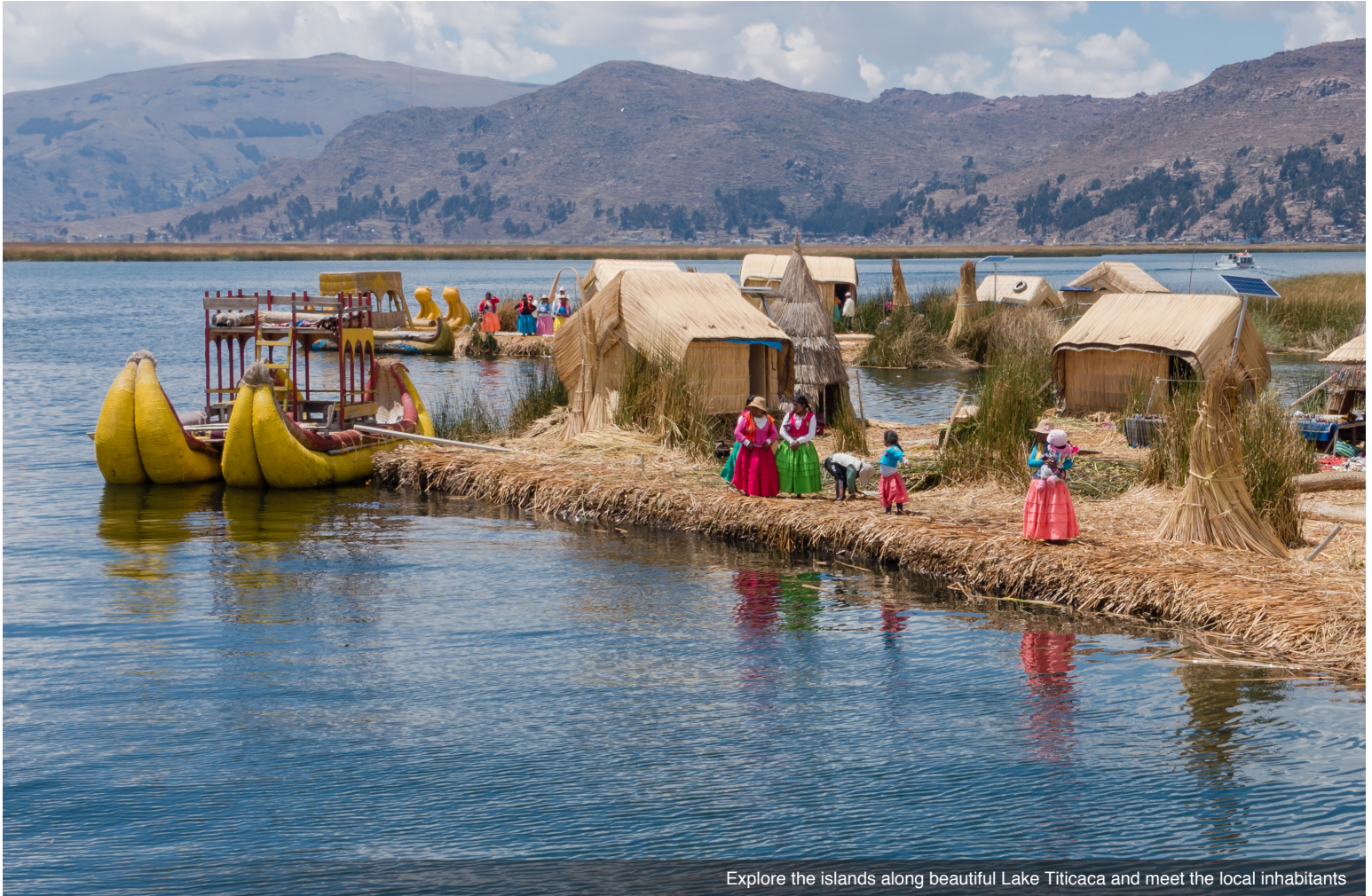
Explore the islands along beautiful Lake Titicaca and meet the local inhabitants