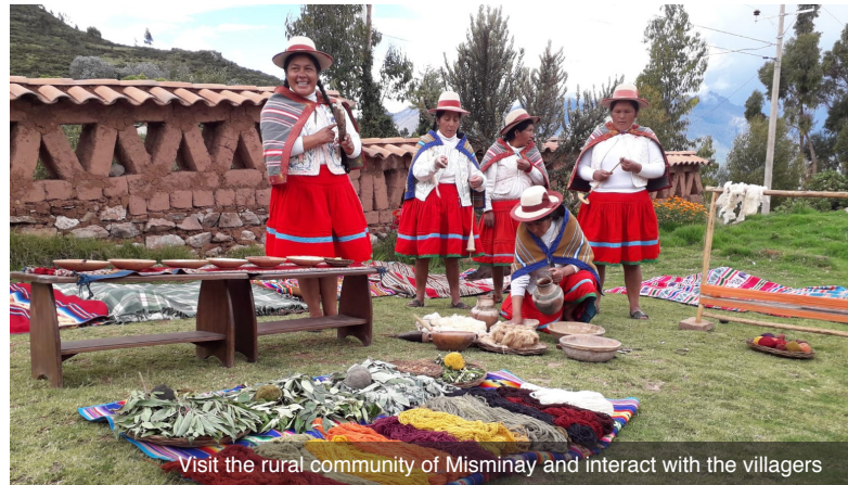
Visit the rural community of Misminay and interact with the villagers

DAY 1 Depart the USA: Depart the USA on a flight to Lima, Peru. With a late evening arrival, the Mayflower Cruises & Tours representative will meet you at the airport and walk you across the street to the hotel.